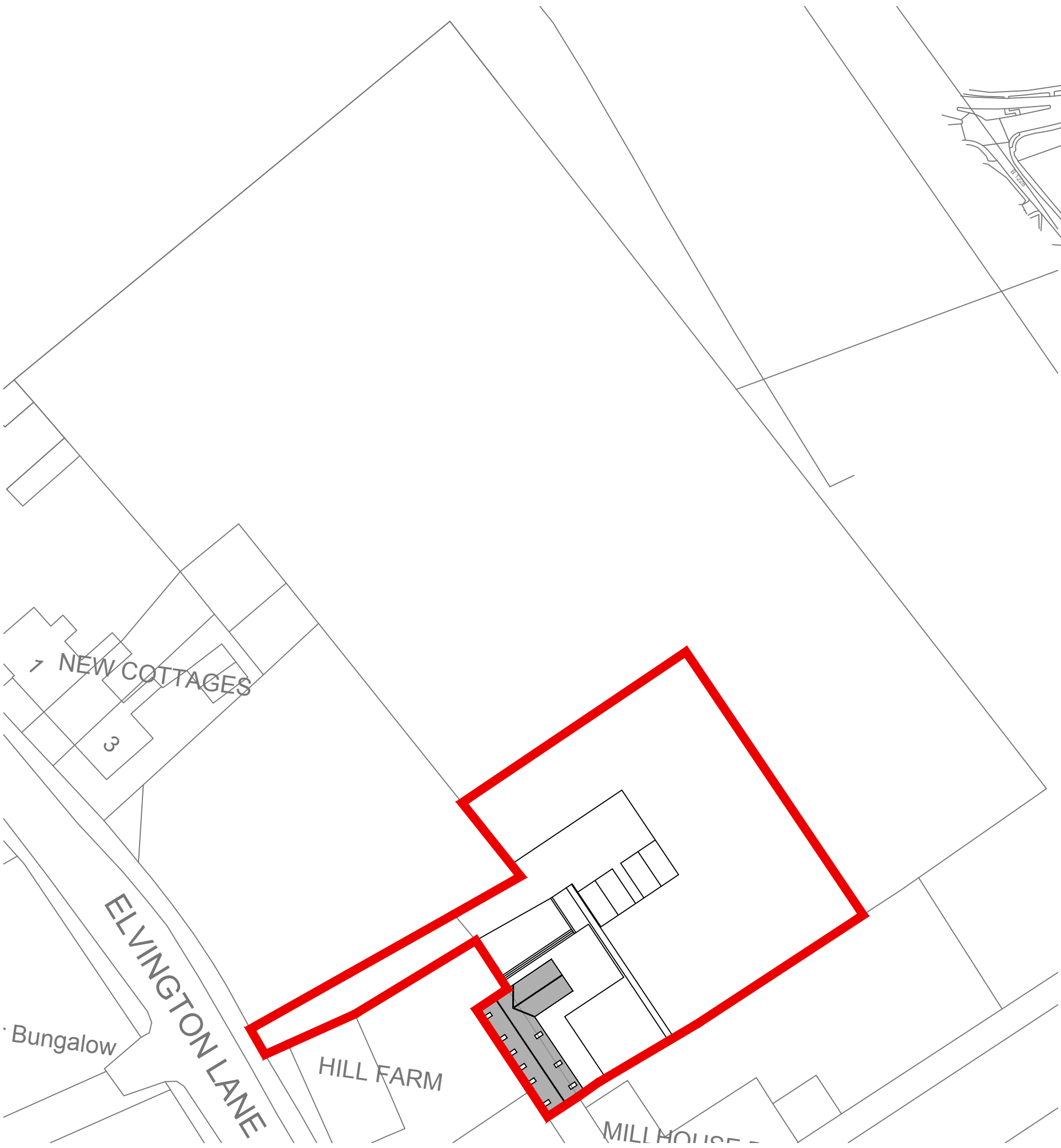
PROPOSED BLOCK PLAN @ 1:500