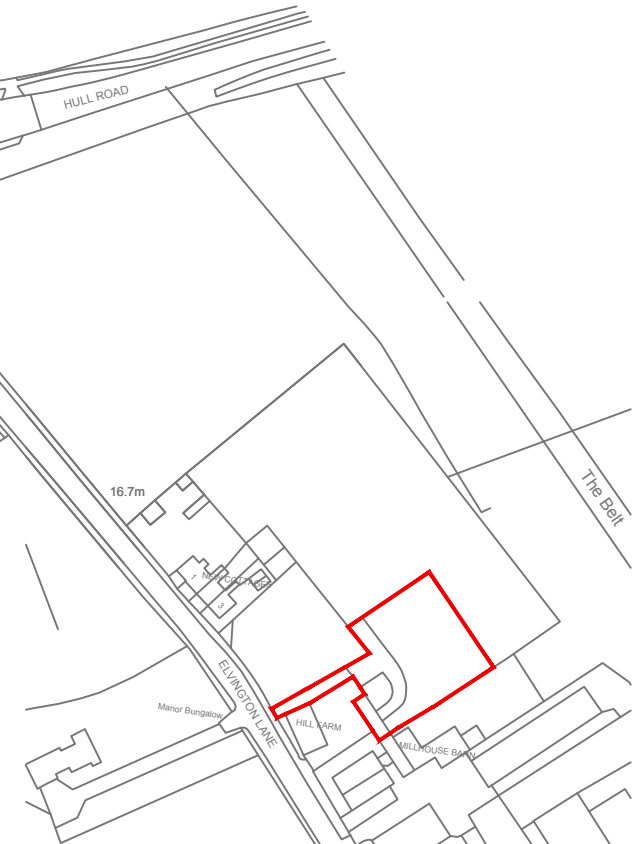
LOCATION PLAN 1:2500