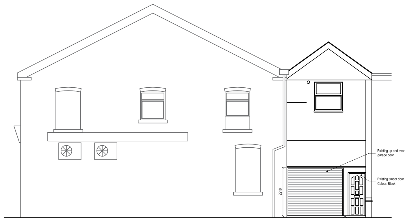
EXISTING ELEVATION VYNER STREET

F Feasibility SK Sketch L Landscape C Construction P Planning M Marketing S Survey AB As Built T Tender