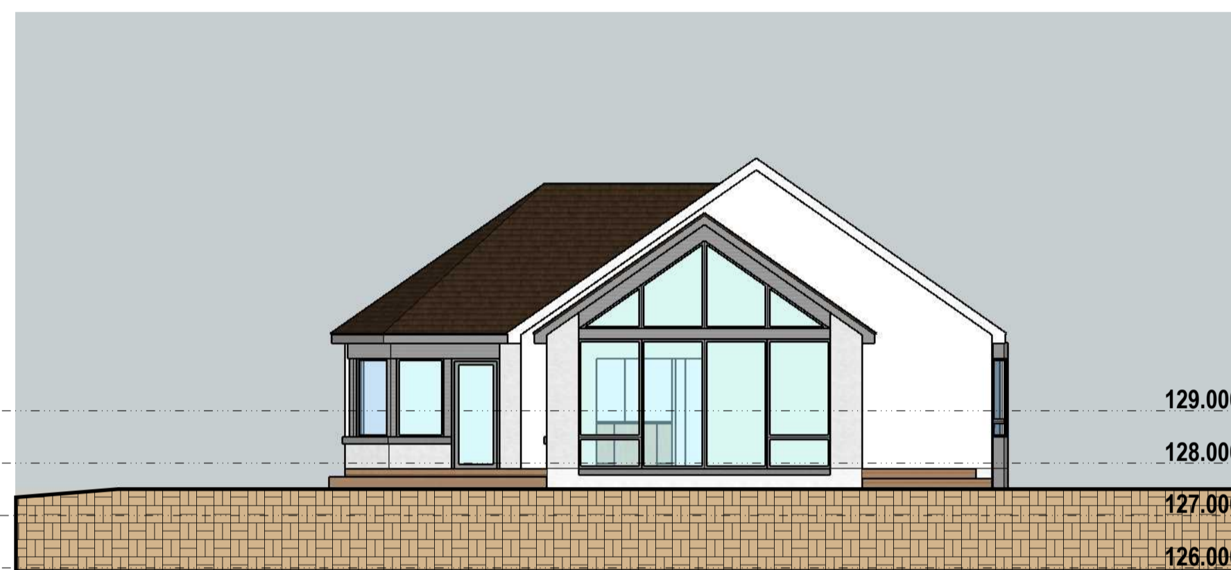
CROSS SECTION C:C 1:100