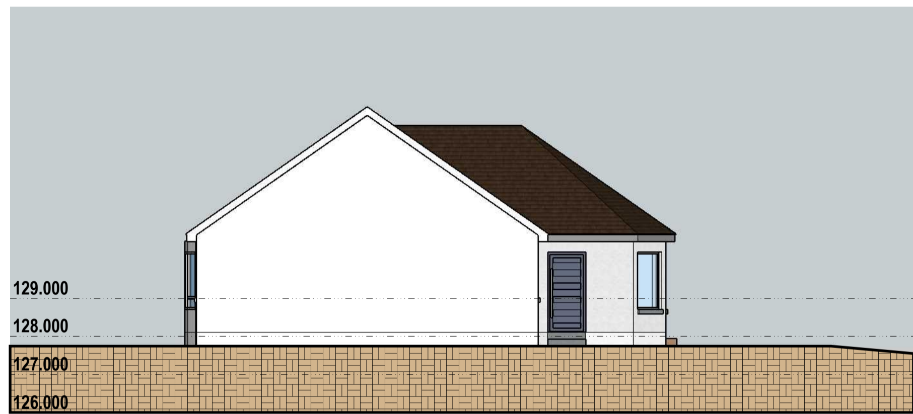
CROSS SECTION B:B 1:100

PROPOSED FINISHES; ALL WALLS ARE TO BE FINISHED IN CORRENNIE TYPE DRY DASH RENDER ON A GREY CEMENT BACK GROUND WITH SMOOTH CEMENT BASECOURSE TO MATCH THAT OF THE EXISTING HOUSE. NEW ROOF IS TO BE FINISHED IN MARLEY LUDLOW MAJOR ROOF TILE IN BROWN TO MATCH THOSE ON THE EXISTING HOUSE. ALL NEW WINDOWS ARE TO BE IN WHITE UPVC FINISH TO MATCH THOSE ON THE EXISTING HOUSE. VELUX ROOFLIGHTS ARE TO BE MK08 FIRE ESCAPE TYPE IN STANDARD SLATE GREY FINISH. ALL FASCIAS AND RAINWATER GOODS ARE TO BE IN BLACK TO MATCH THOSE ON THE EXISTING HOUSE. CLADDING TO GLAZED GABLE IS TO BE FINISHED IN HORIZONTAL OR VERTICAL GREY UPVC TIMBER EFFECT LININGS - RAL 7035. ALL FASCIAS AND SOFFITS TO BE FINISHED IN GREY UPVC - RAL 7035. ALL NEW WINDOWS ARE TO BE IN WHITE UPVC FINISH TO MATCH THOSE ON THE EXISTING HOUSE. DOORS ARE TO BE FINISHED TO EXTERNAL FACE IN GREY UPVC - RAL 7035 OR RAL 7016. ALL FENCING TO SITE BOUNDARY IS TO BE FINISHED IN STOCKPROOF TIMBER POST & WIRE FENCING. ALL PROPOSED FINISHED GROUND LEVELS ARE TO REMAIN SAME AS THE EXISTING GROUND LEVELS AS SHOWN ON THE ATTACHED ELEVATIONAL DRAWINGS