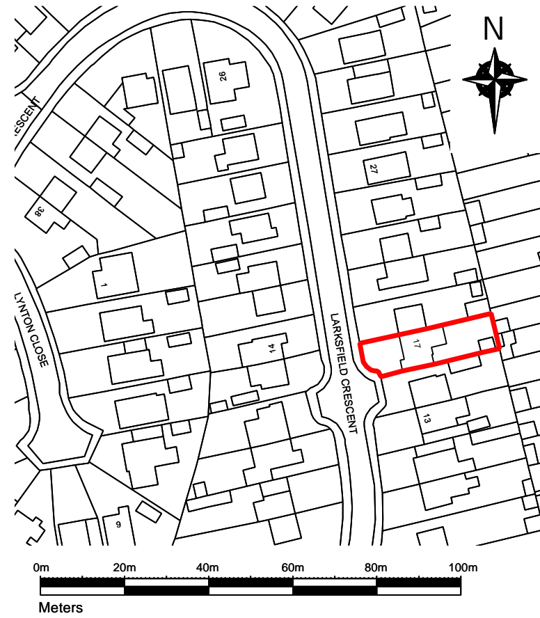
17 LARKSFIELD CRESCENT: LOCATION PLAN SCALE: 1:1250@A3