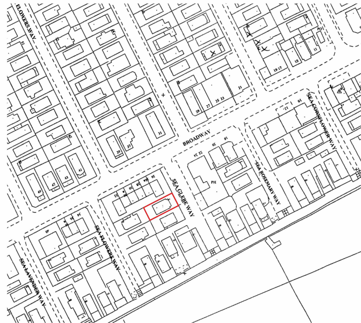
Site Location Plan - Scale 1:1250