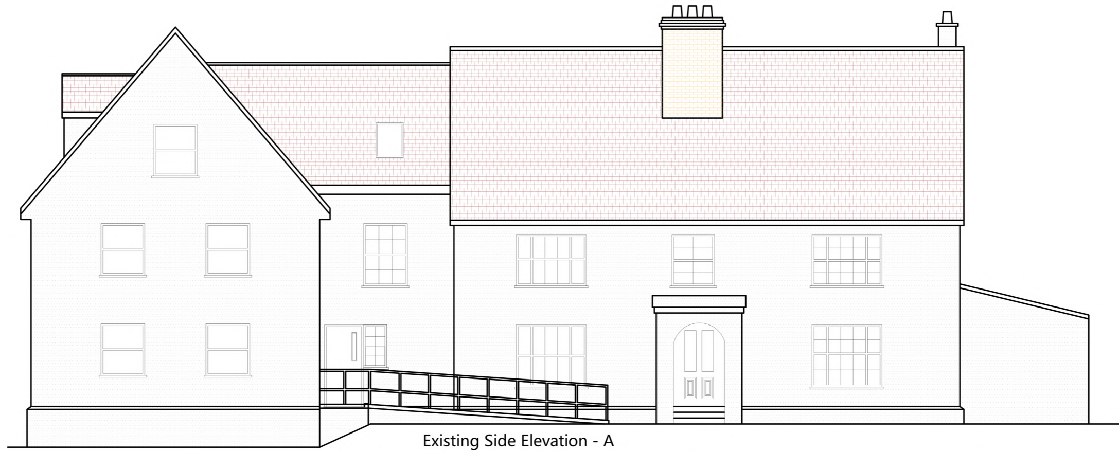
Existing Side Elevation - A