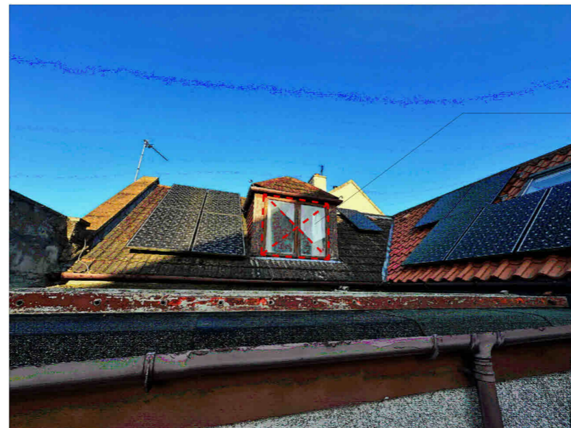
Exist' View of Rear from Neighbouring Plot N.T.S.