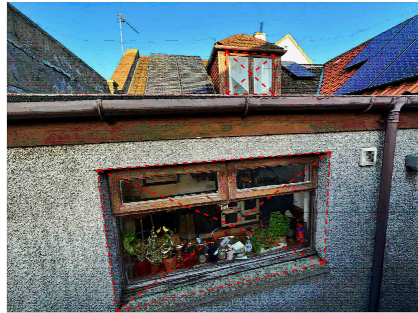
Exist' Kitchen/Bedroom Side Elevation N.T.S.