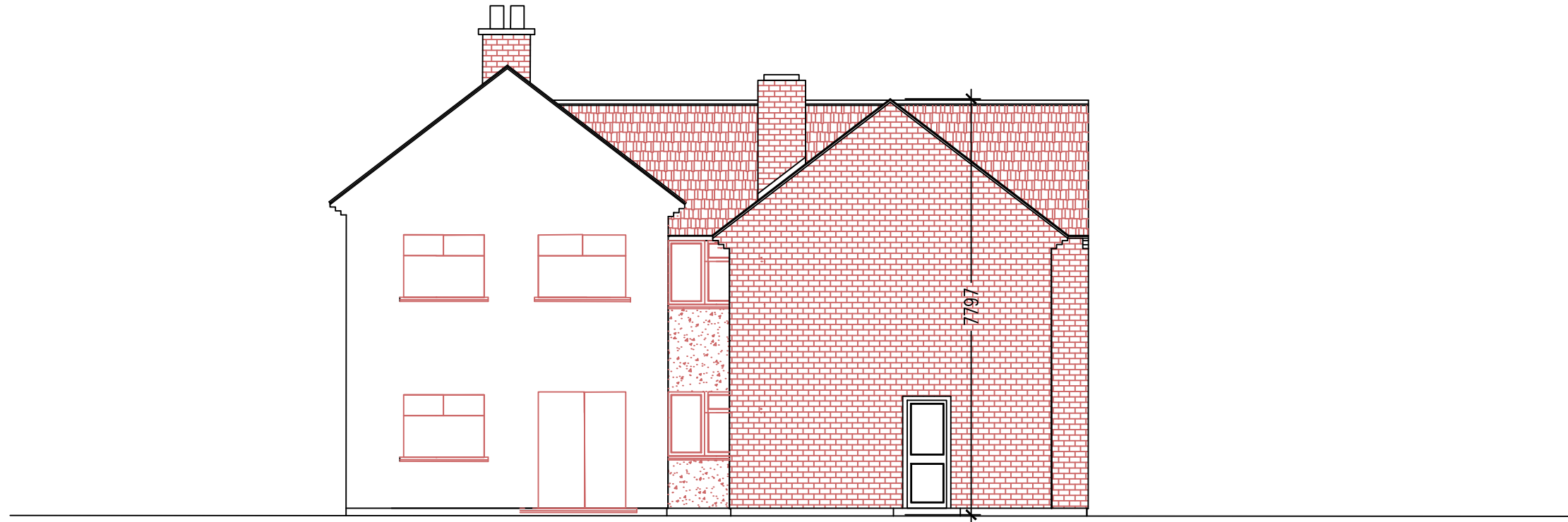
PROPOSED REAR ELEVATION_Option C