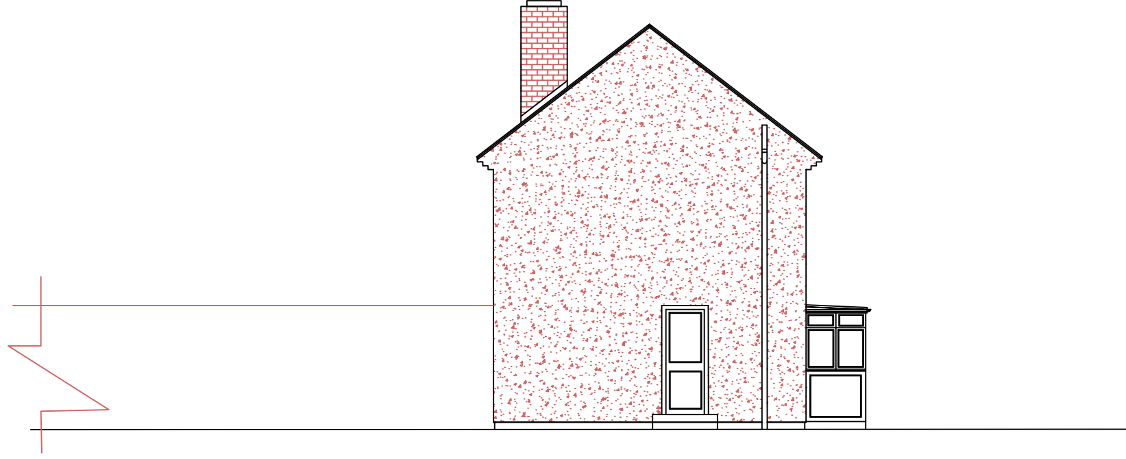
EXISTING LEFT SIDE ELEVATION