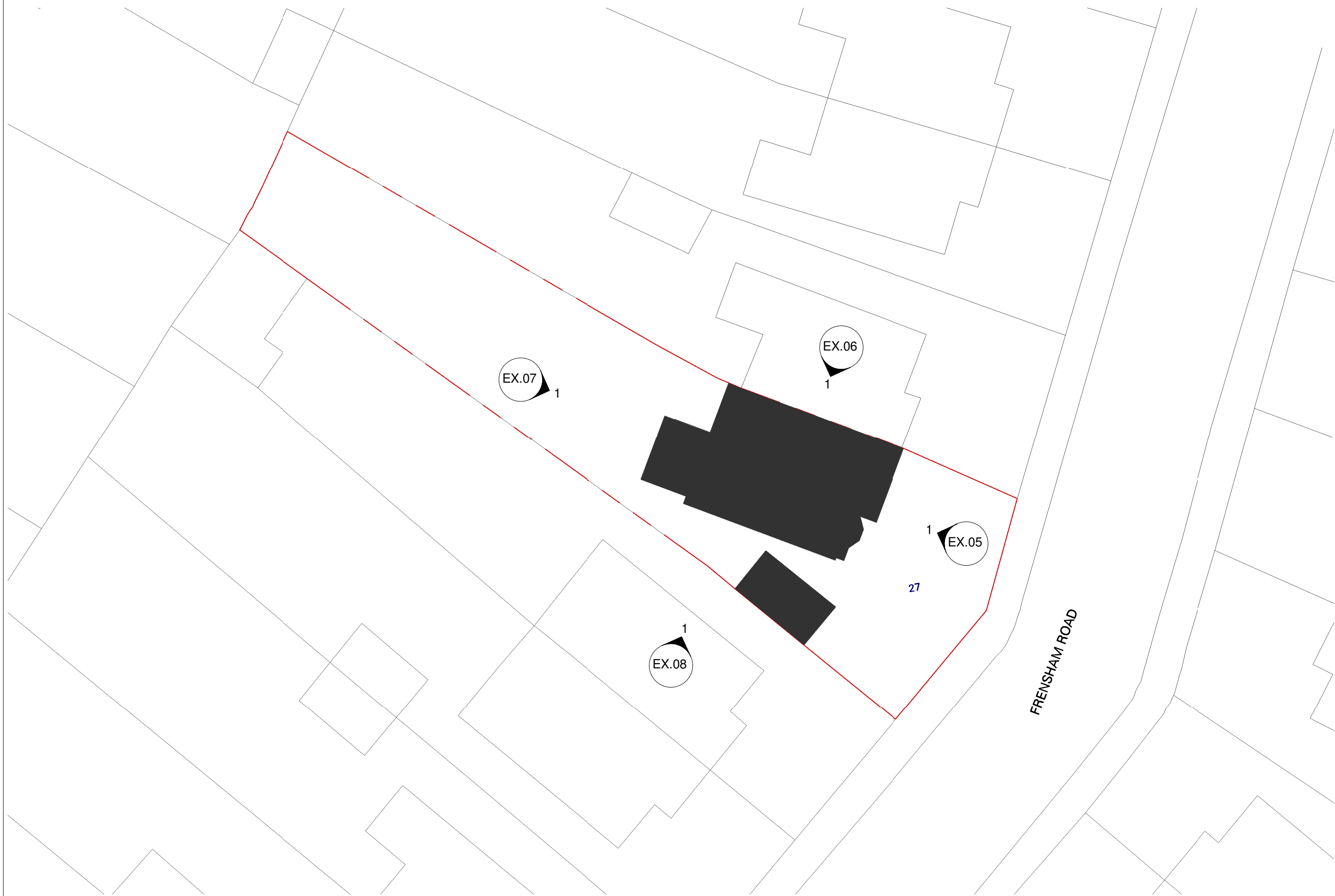
EXISTING SITE BLOCK PLAN 1 : 200