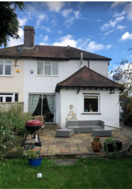
REAR VIEW OF PROPERTY