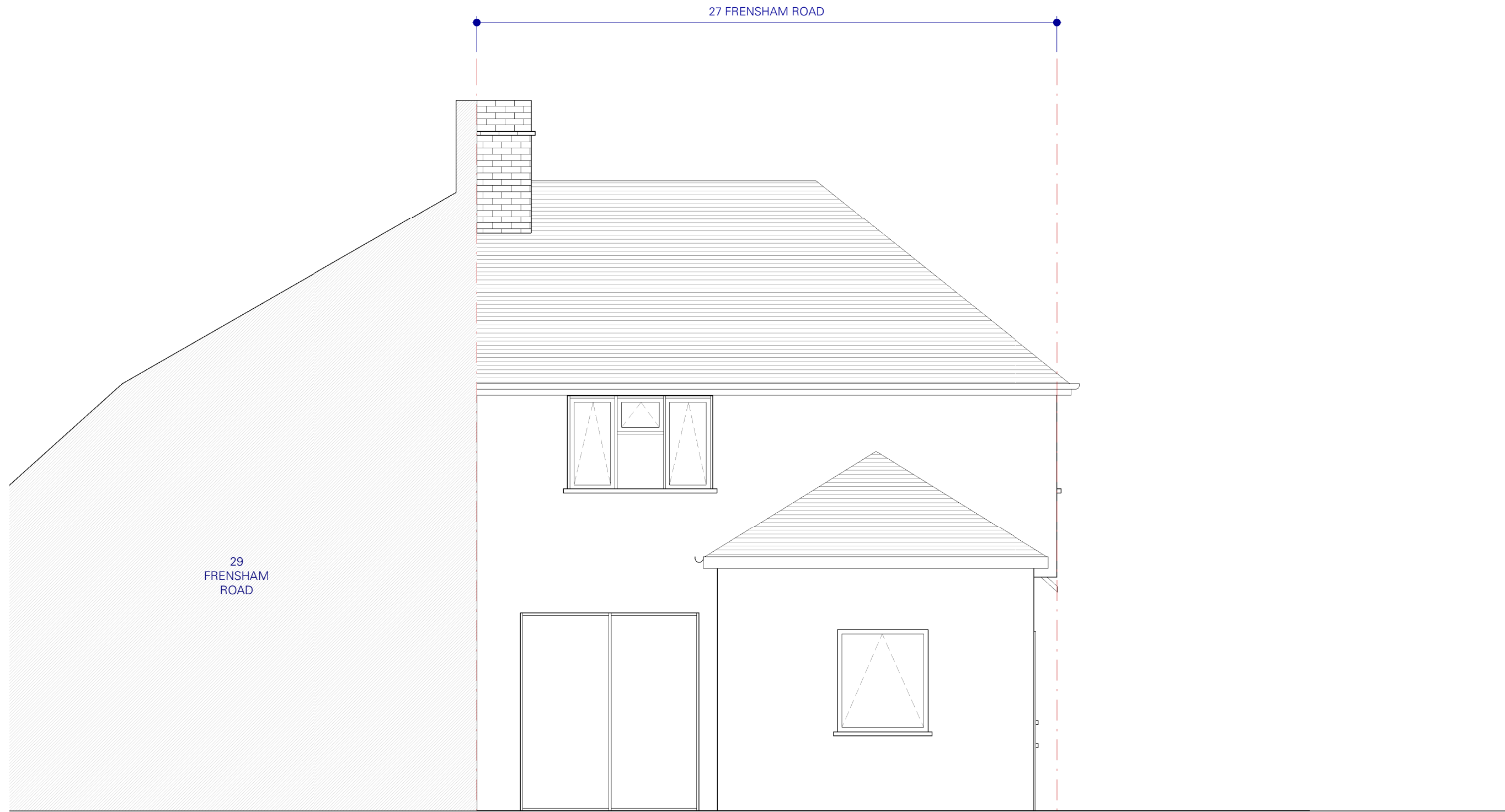
EXISTING REAR ELEVATION 1 : 50