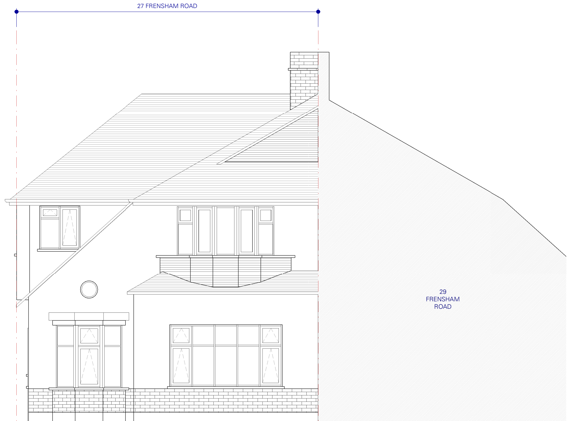
EXISTING FRONT ELEVATION 1 : 50