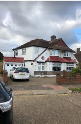
STREET VIEW OF PROPERTY