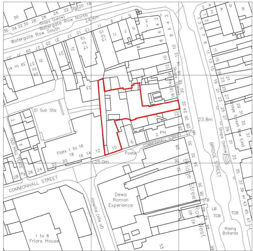
SITE LOCATION PLAN @ 1:1250

©MONIKA STUDIO This design and drawing is the copyright of ME and may not be reproduced in any form whatsoever without prior written consent. Issue of the drawing does not impart any real or implied copyright license. This drawing must be read in conjunction with all architects, contracts, subcontractors and specialist drawings. Do not scale from this drawing.