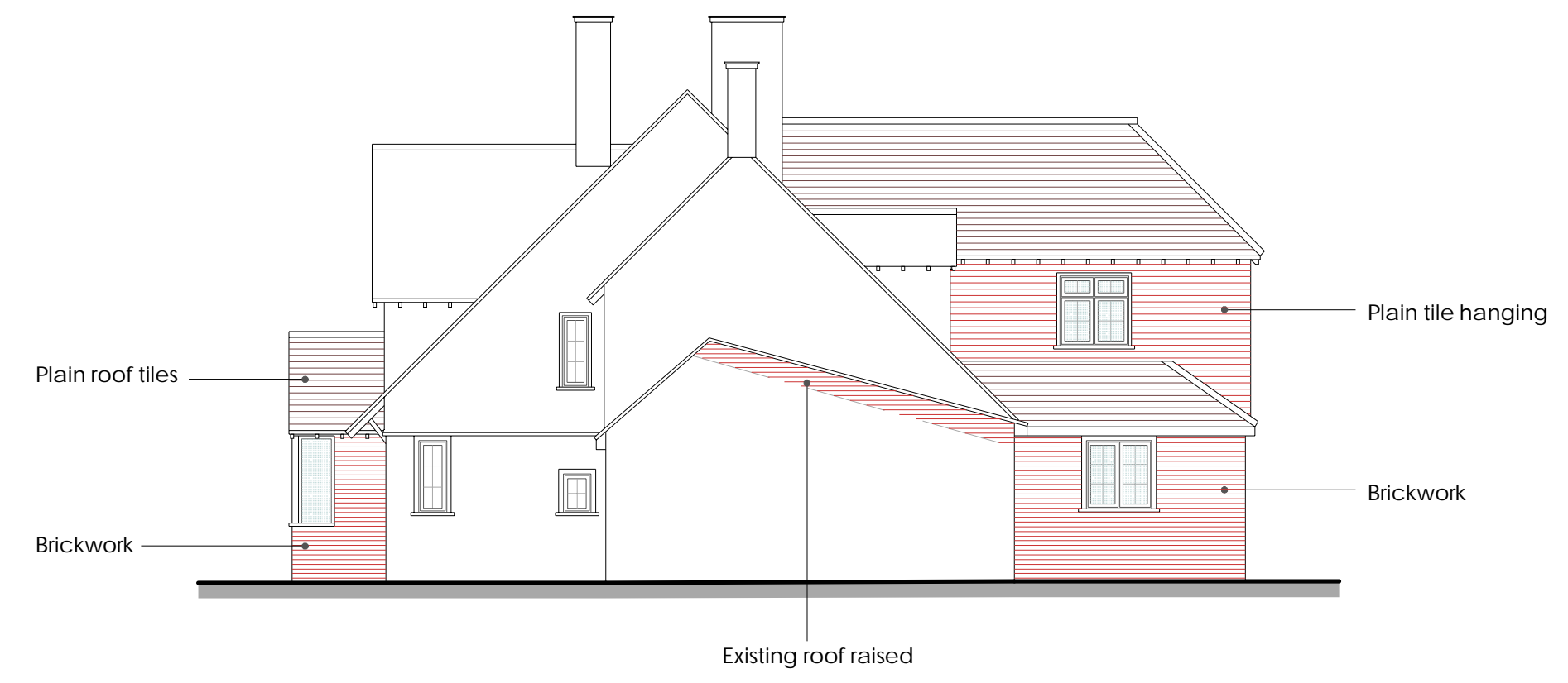
Side Elevation As Proposed