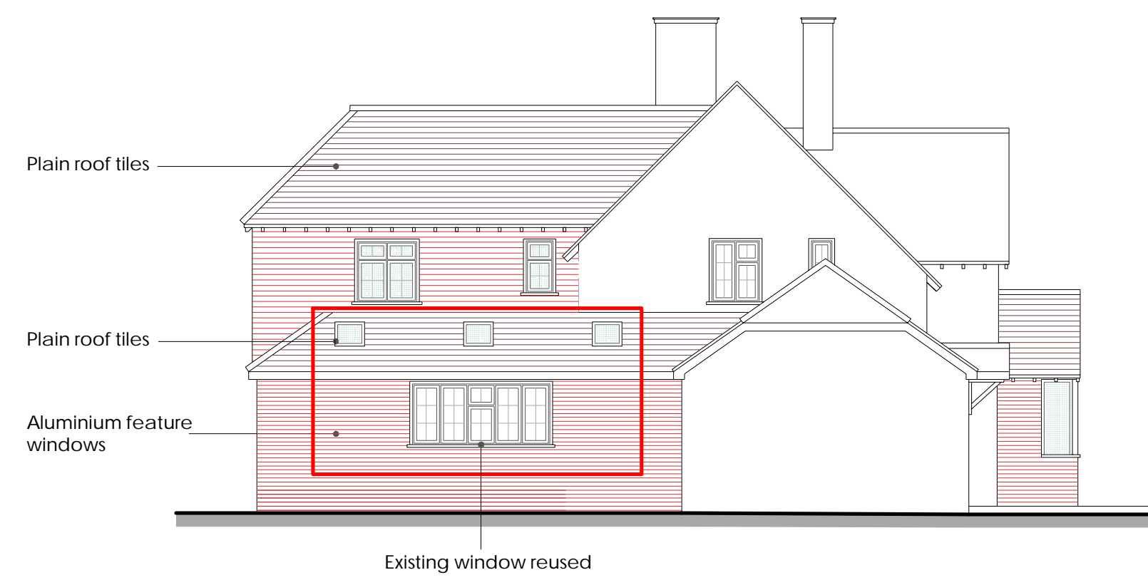
Side Elevation As Proposed