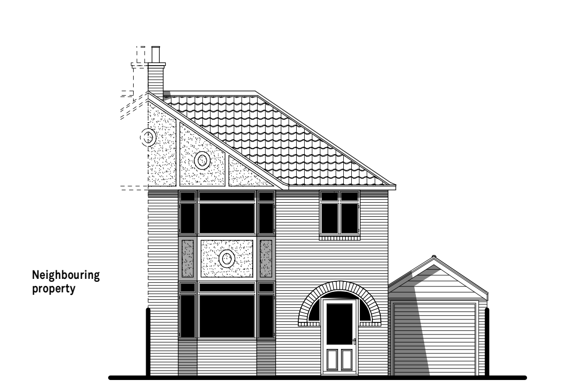
SOUTH EAST ELEVATION (FRONT)