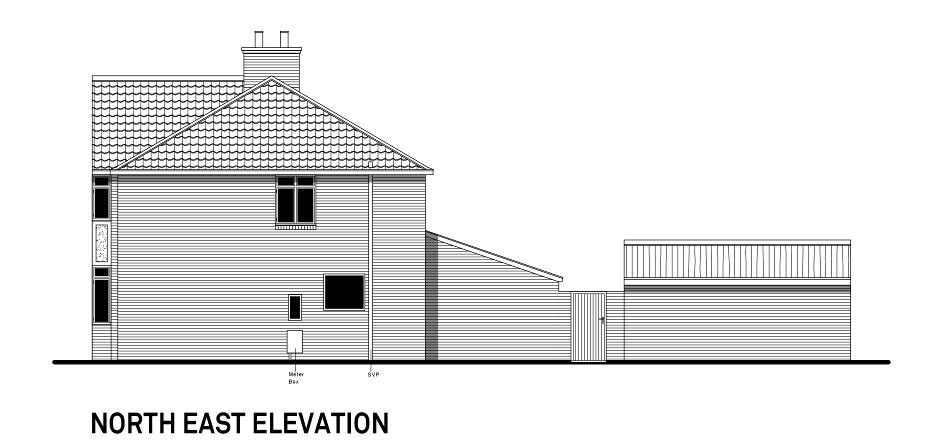
Neighbouring property Boundary Fence —