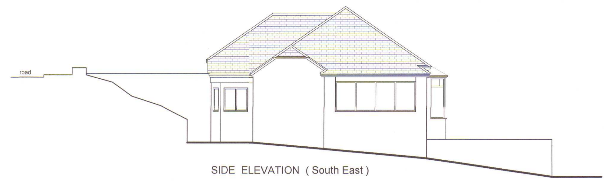
SIDE ELEVATION ( South East )