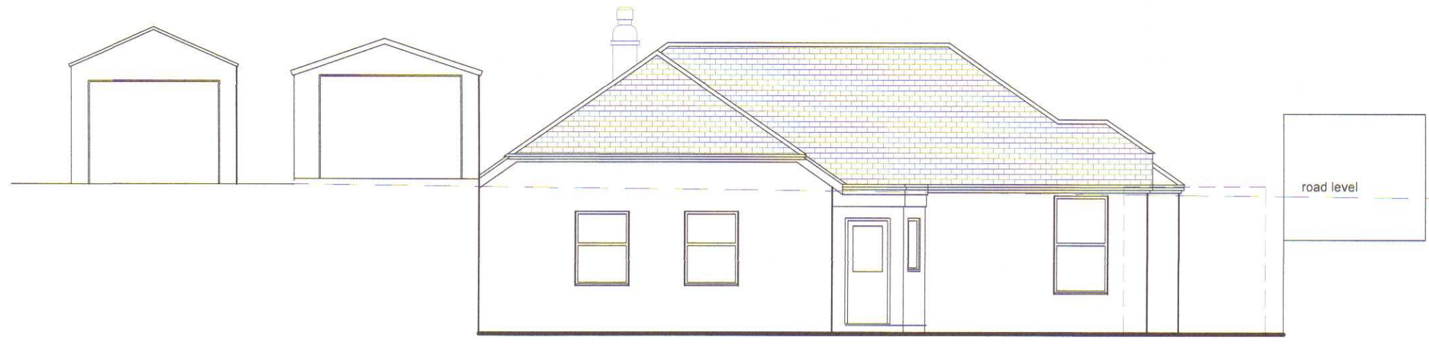
FRONT ELEVATION ( West )