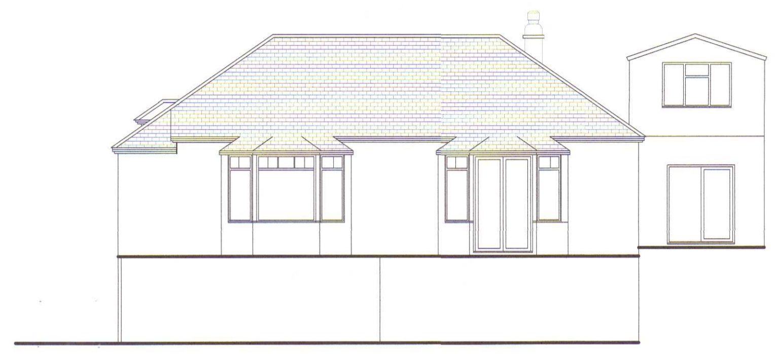
REAR ELEVATION ( East )