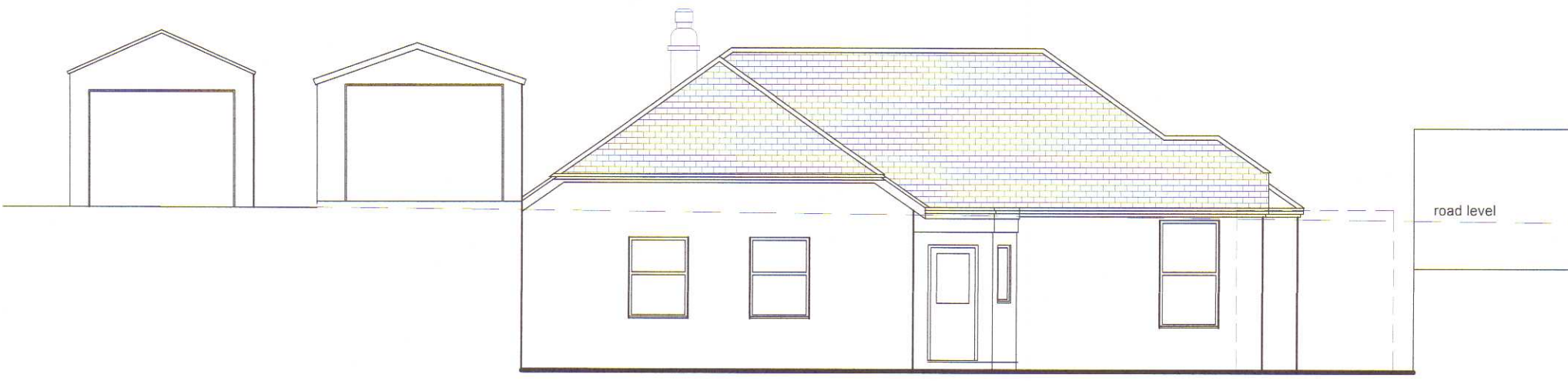
FRONT ELEVATION ( West )