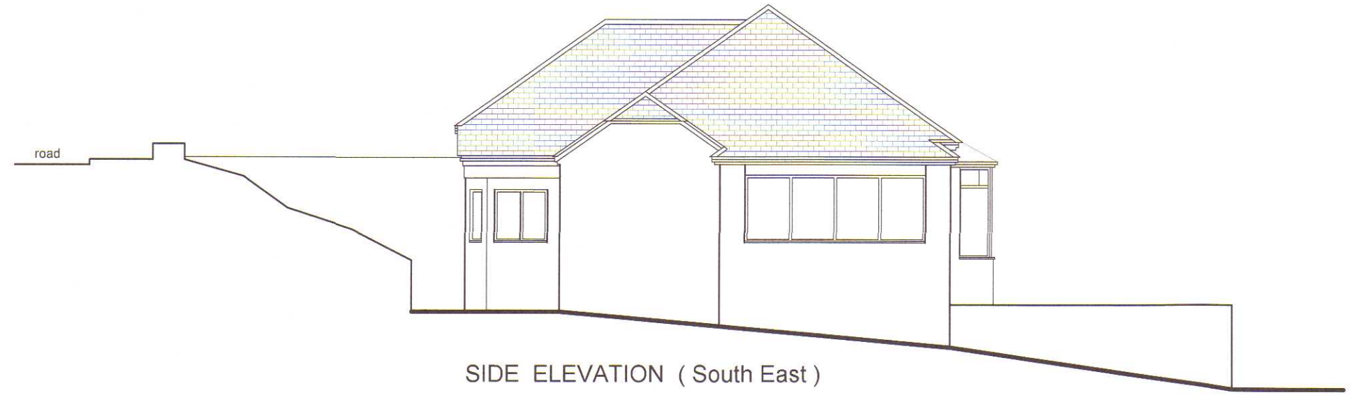
SIDE ELEVATION ( South East )