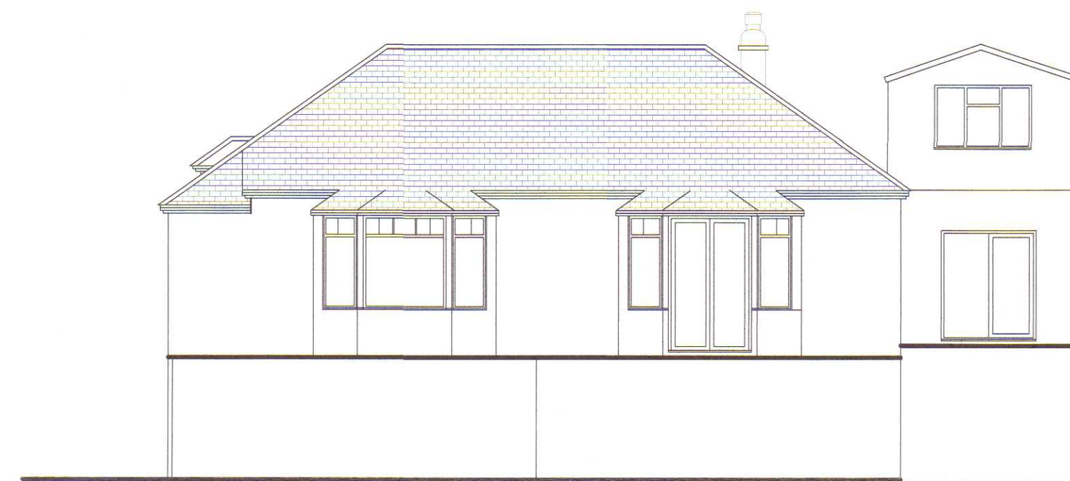
REAR ELEVATION ( East )