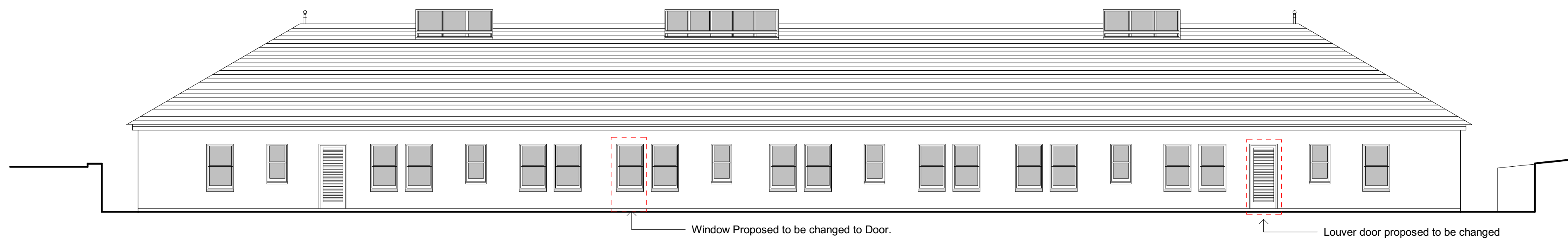
North Elevation – Rear