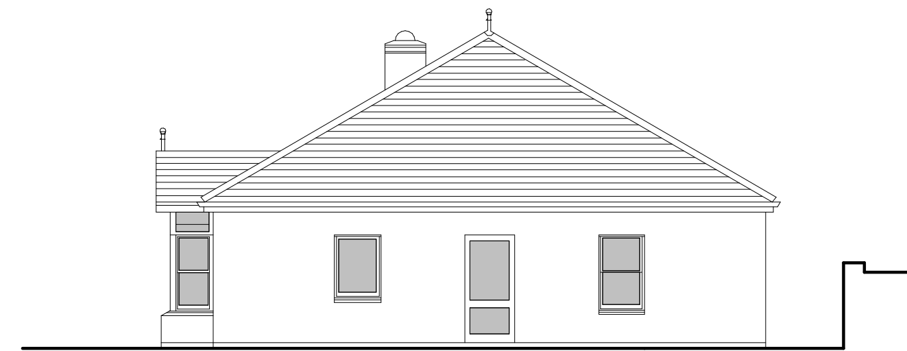
East Elevation – Side 2