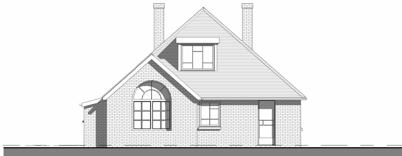
3 East Elevation 1 : 100