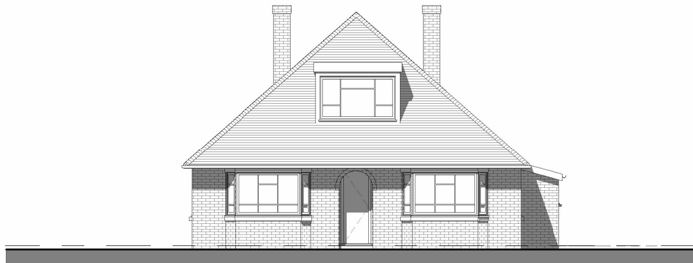
1 West Elevation 1 : 100