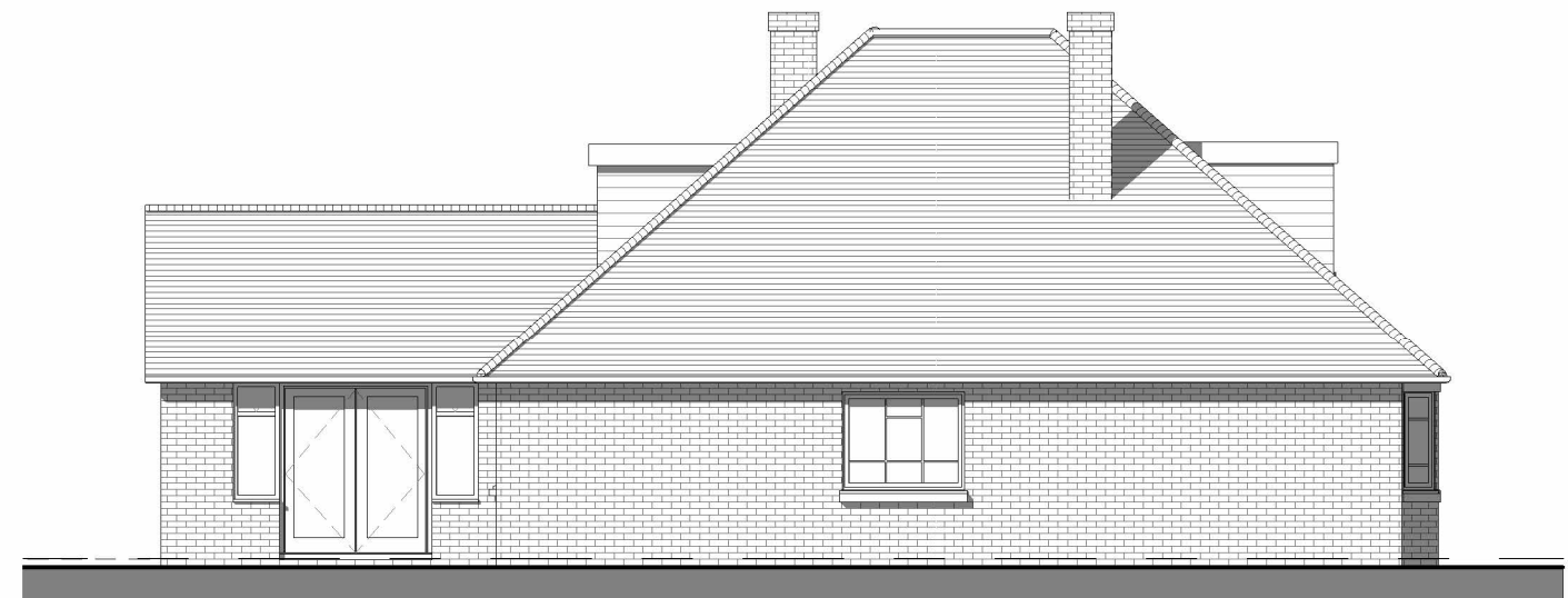
2 North Elevation 1 : 100