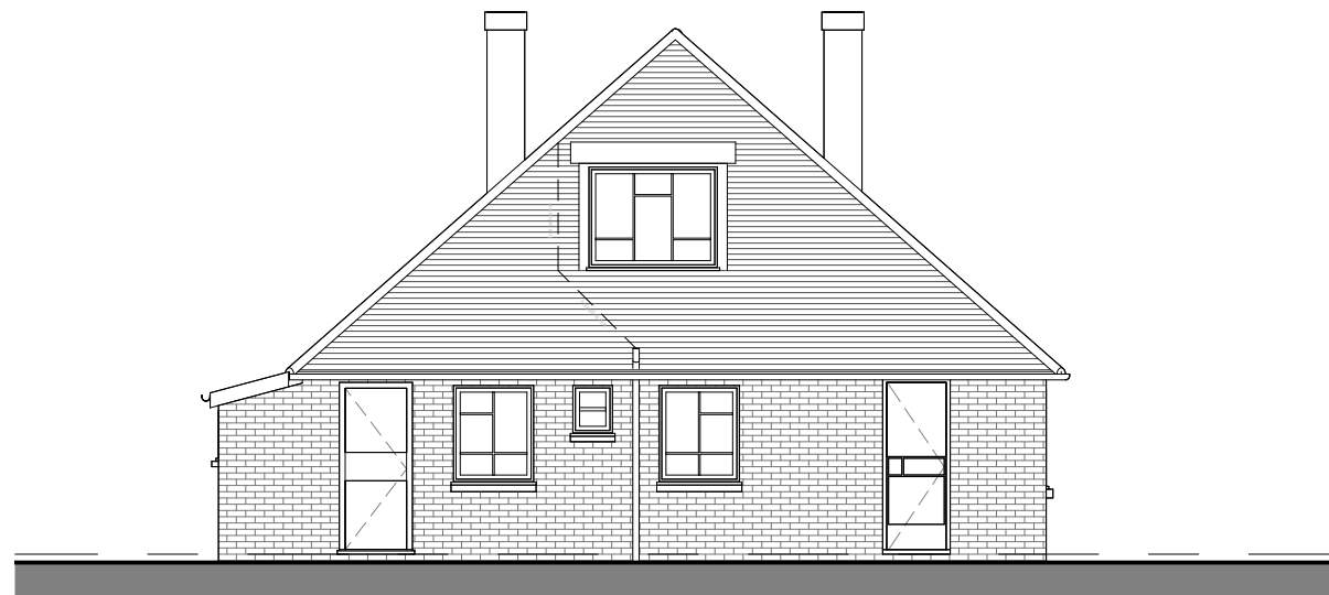
1 East Elevation 1 : 100