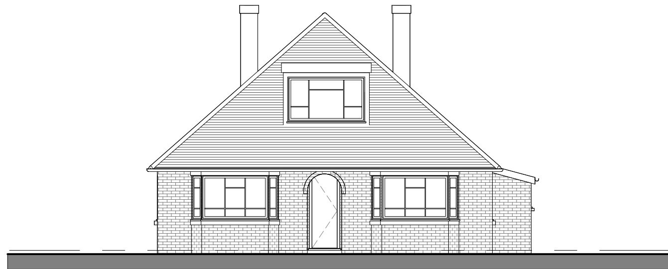
2 West Elevation 1 : 100