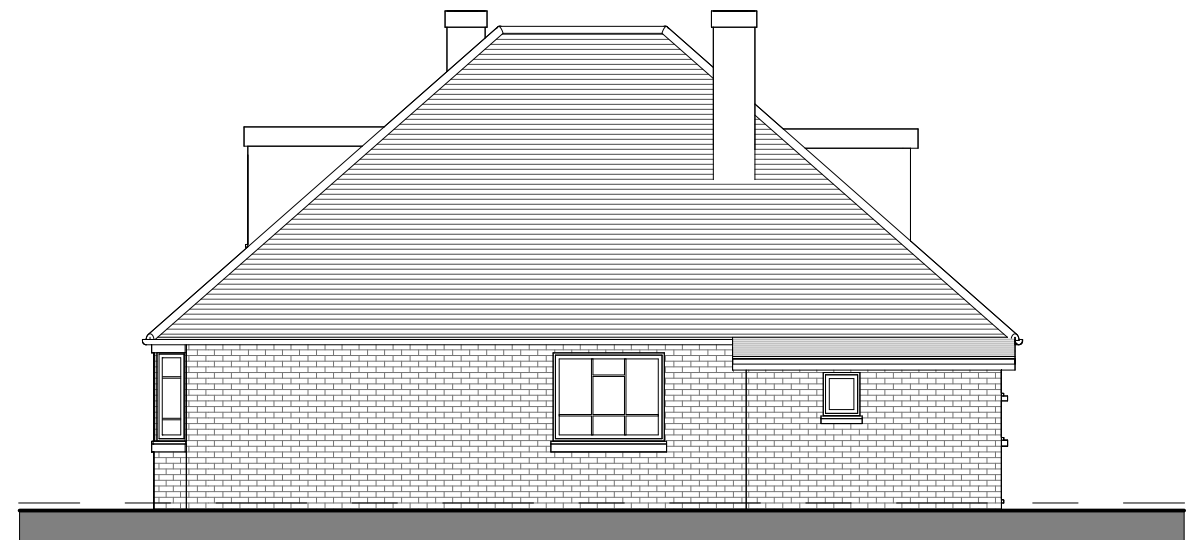
3 South Elevation 1 : 100