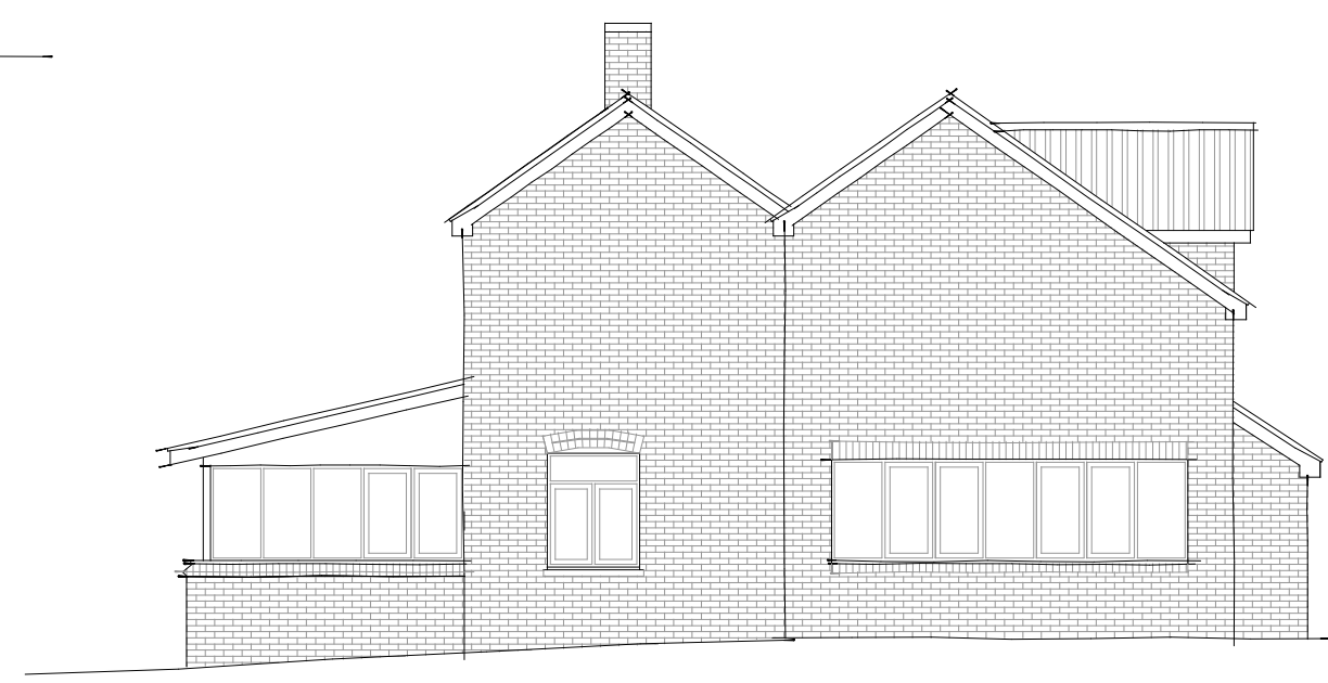
SIDE ELEVATION [EAST]