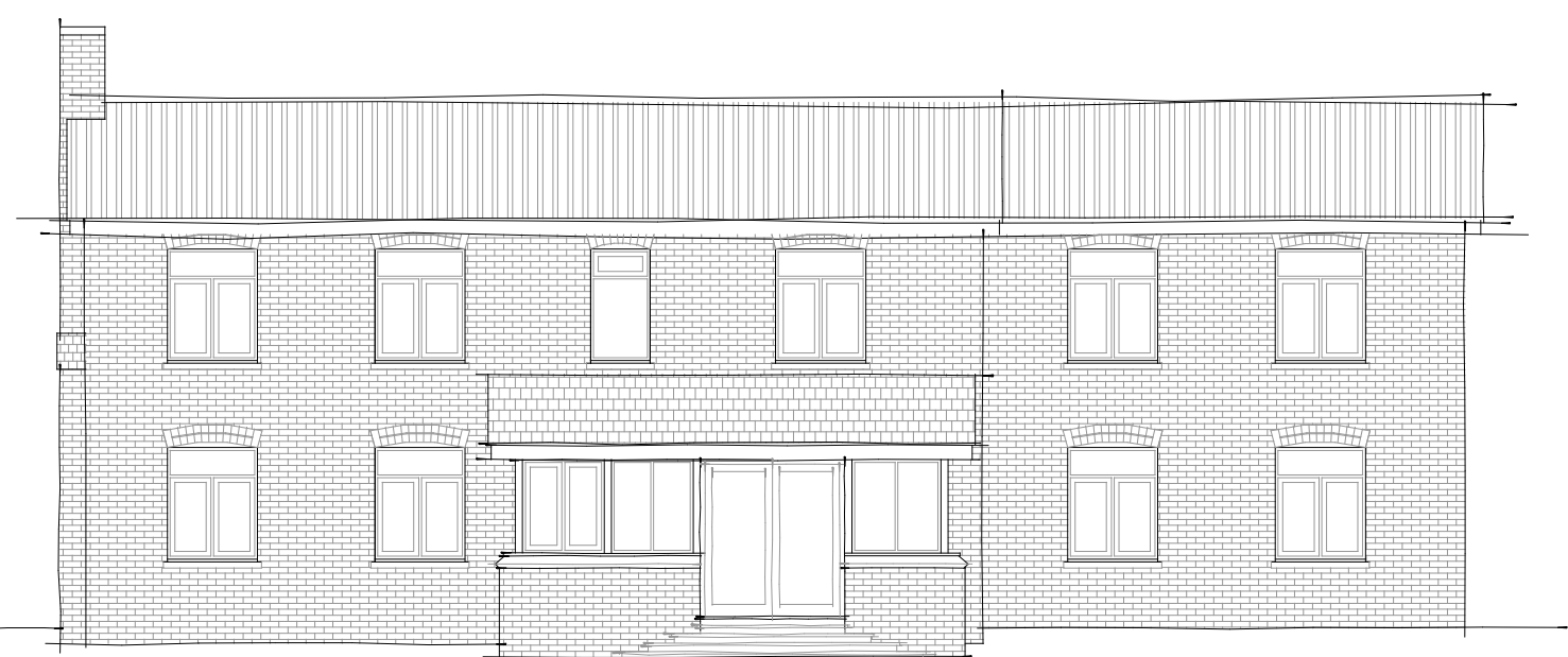
FRONT ELEVATION [SOUTH]