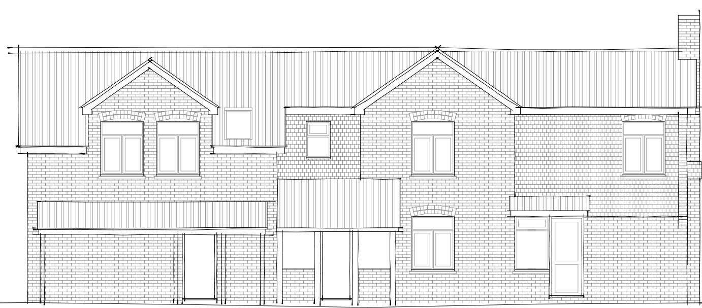
REAR ELEVATION [NORTH]

Dimensions should not be scaled from this drawing prior to checking the accuracy of the image against the scale bar. Contractors must check all dimensions angles etc., on site prior to commencement.