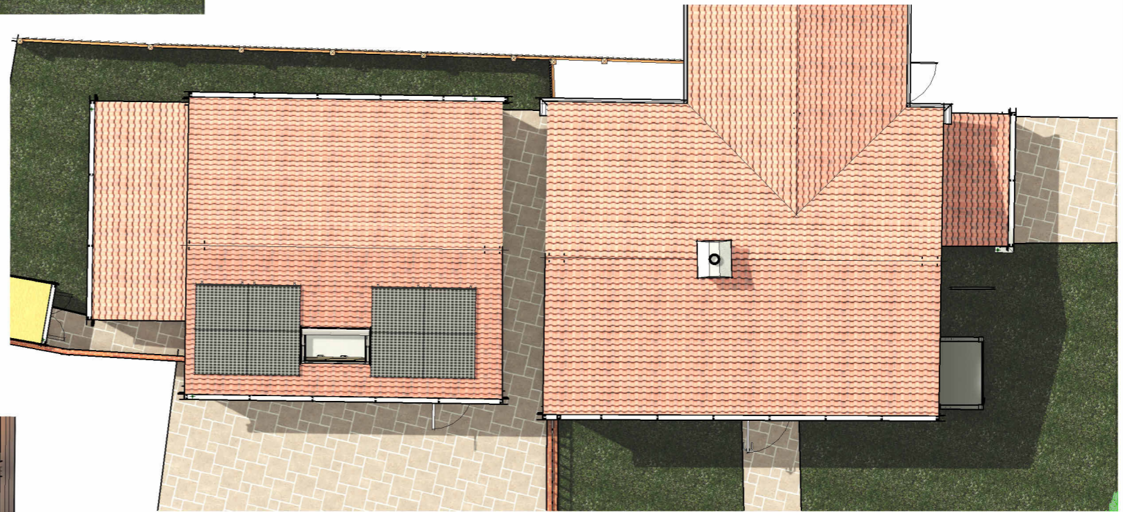
RP PROPOSED ROOF PLAN Scale 1:100