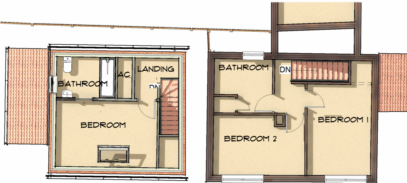
FF PROPOSED FIRST FLOOR Scale 1:100