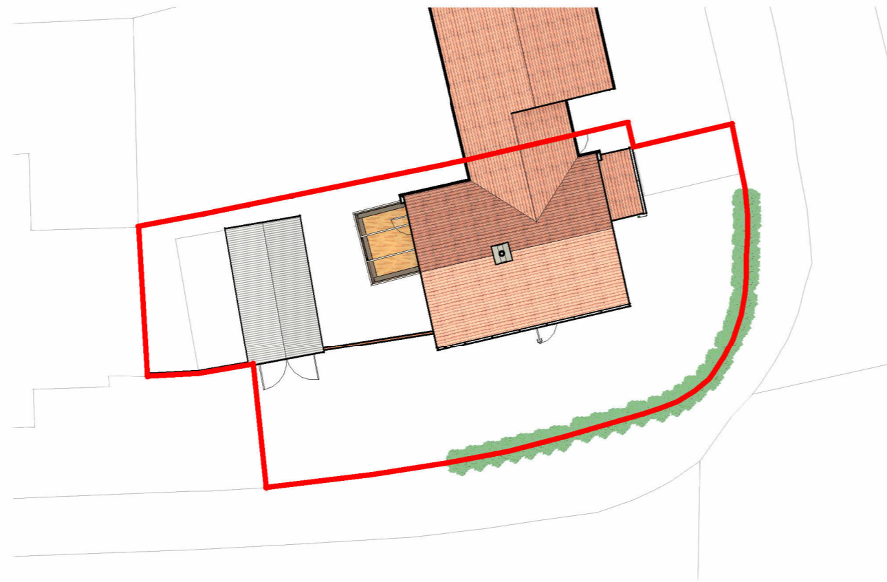
BP BLOCK PLAN Scale 1 : 200