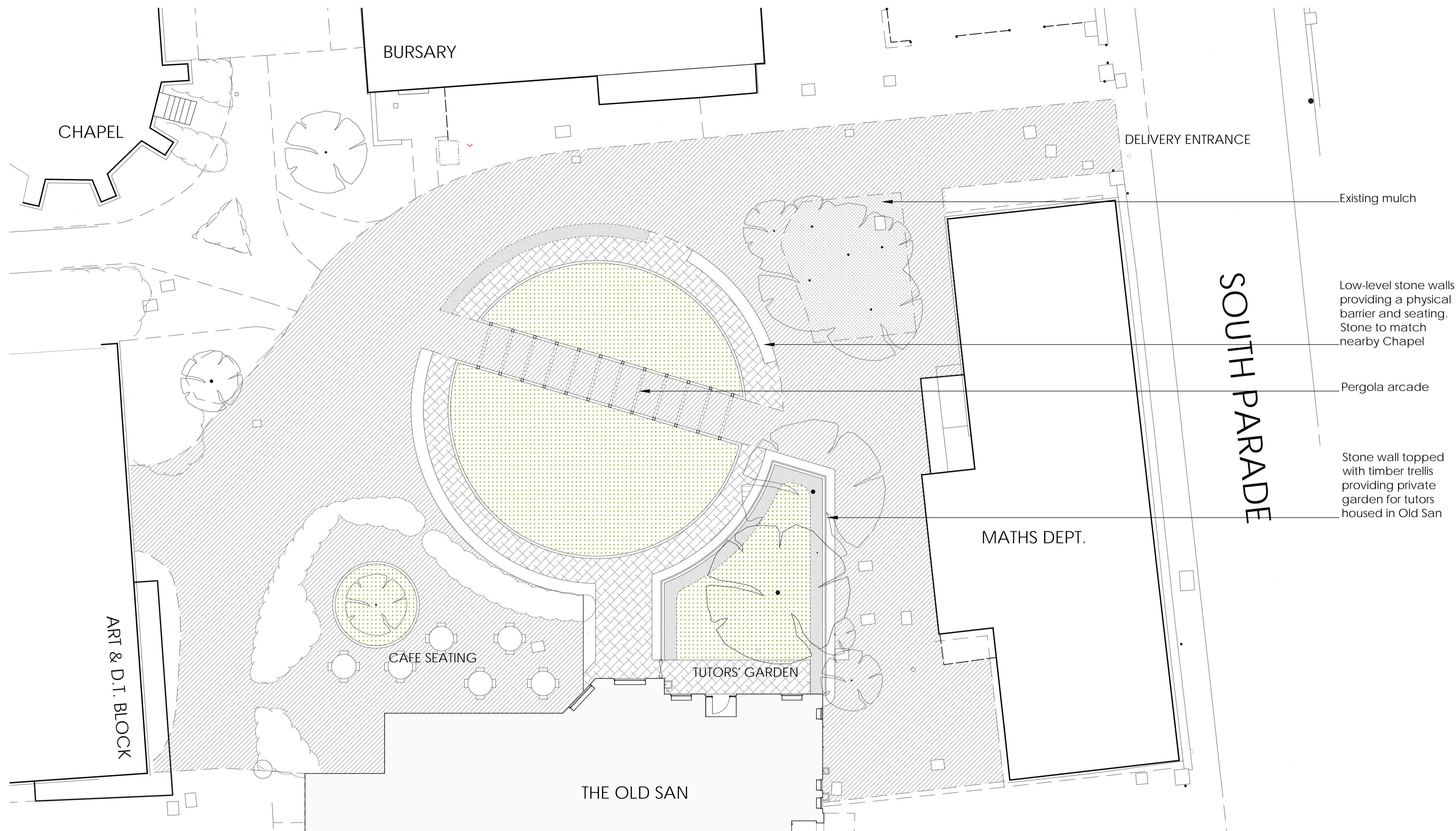
ABOVE: Landscape proposals 1:100