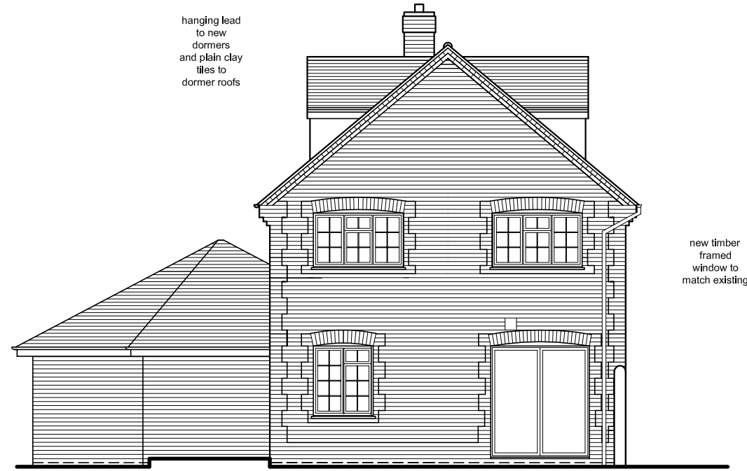
south (side) elevation

scale at A3 1:100 date June 2021 drawn by jmac