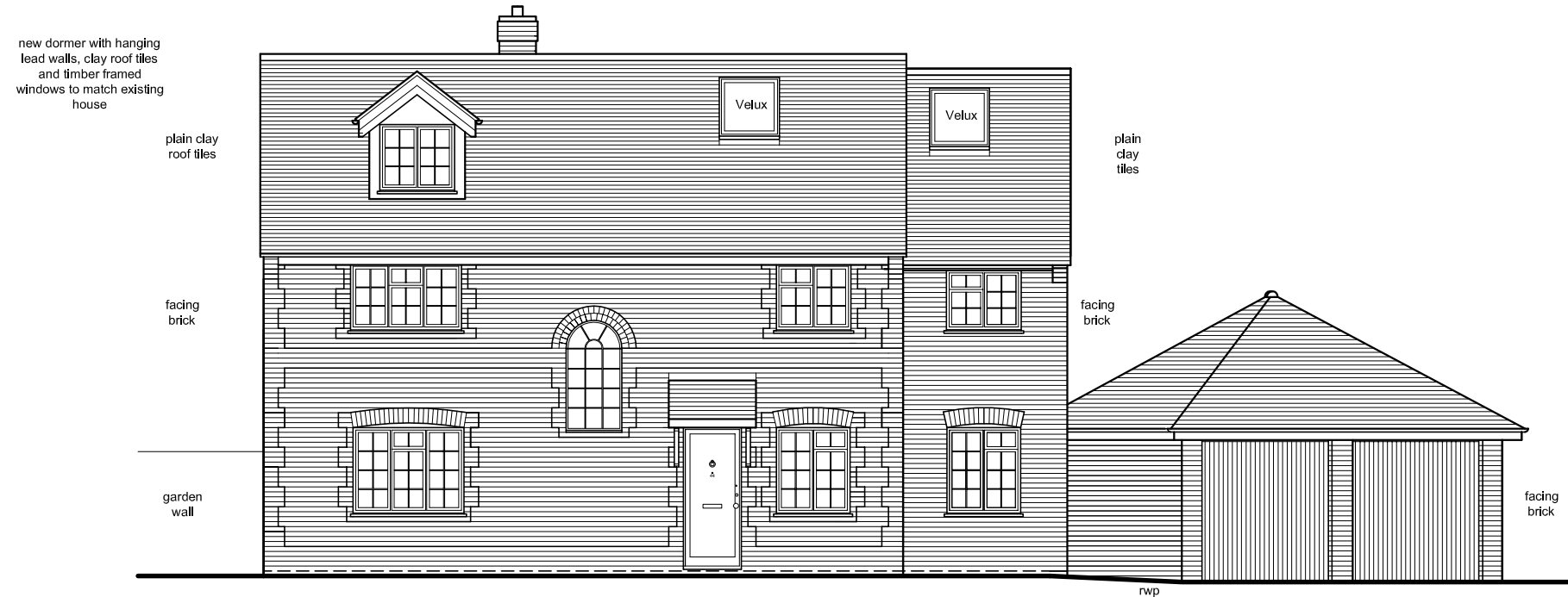
east (front) elevation

scale at A3 1:100 date July 2021 drawn by jmac