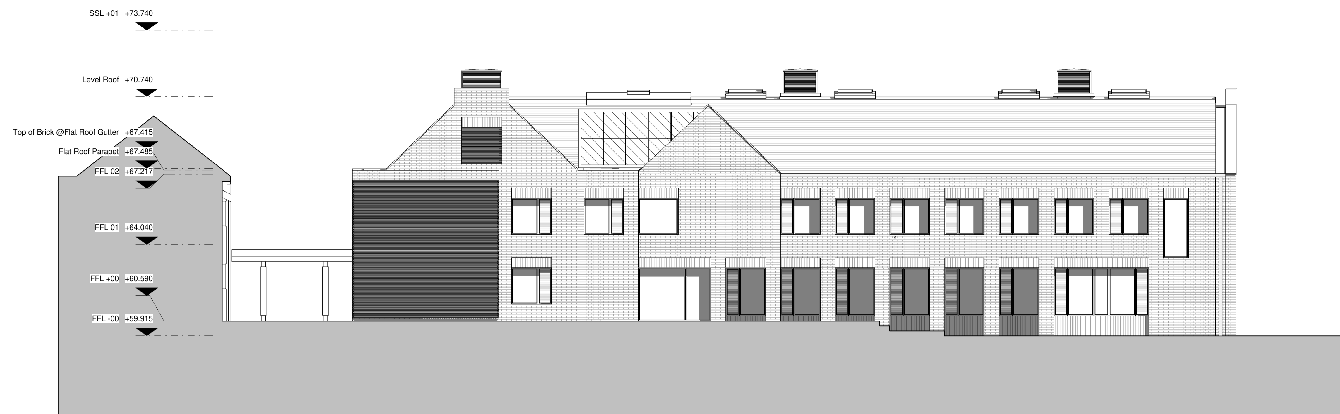
2 West Elevation 1:100