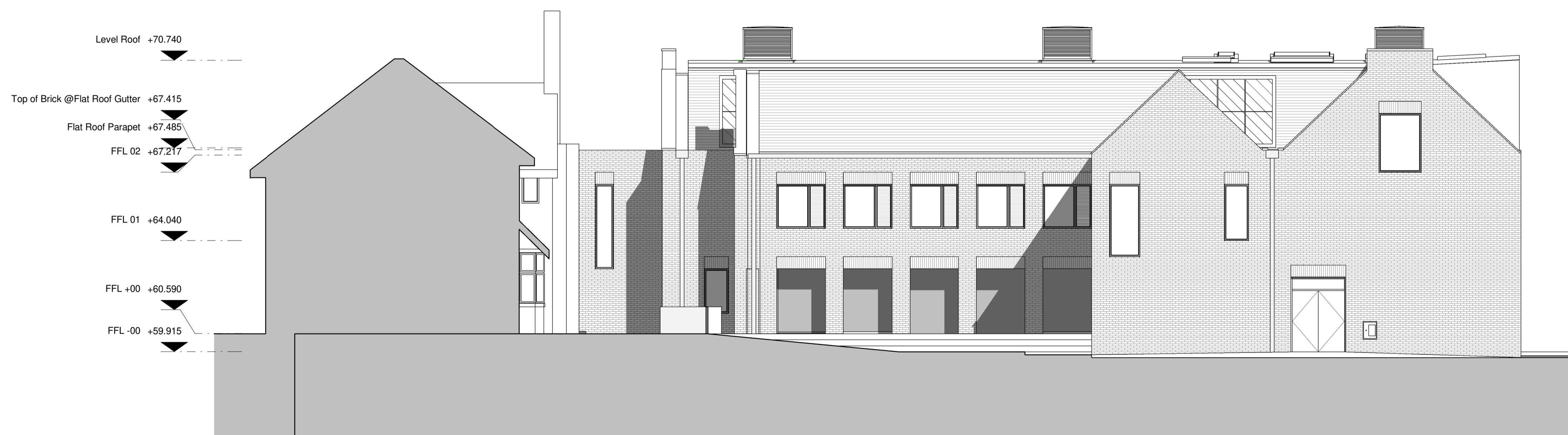
2 South Elevation 1:100