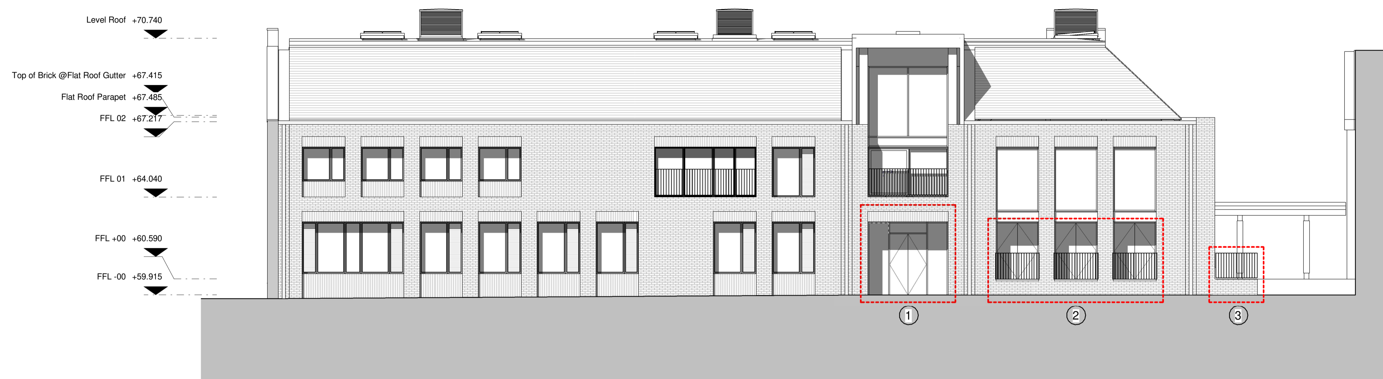
1 East Elevation 1:100