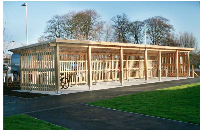
03 CYCLE SHELTER DETAIL 304 IMAGE SCALE N.T.S.

NOTE: The existing bicycle shelter is comprised of 27 spaces. It is 1.9m deep and has a total length of 15.3m. This will be re-provided in the proposed location giving a total of 30 spaces. The proposed shelter is 2.5m deep and a total length of 15.6m