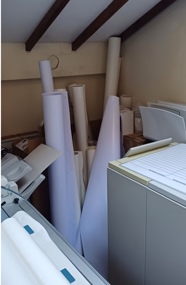
Inaccessible printers and binding machines