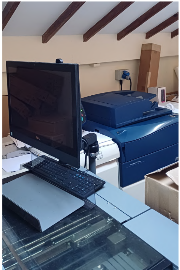
Inaccessible printers and binding machines