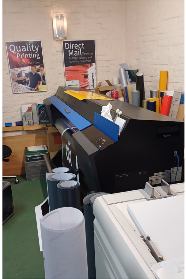
Large format printer and lack of storage