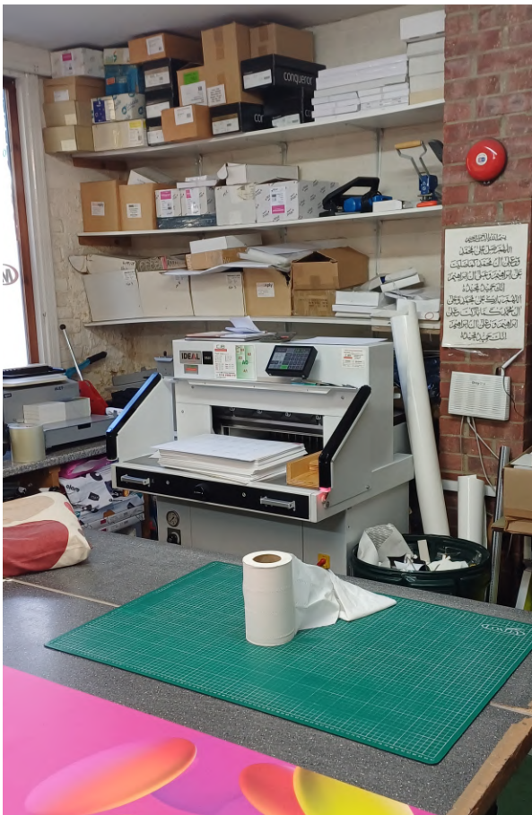
Lack of space for finishing desk & smaller printers