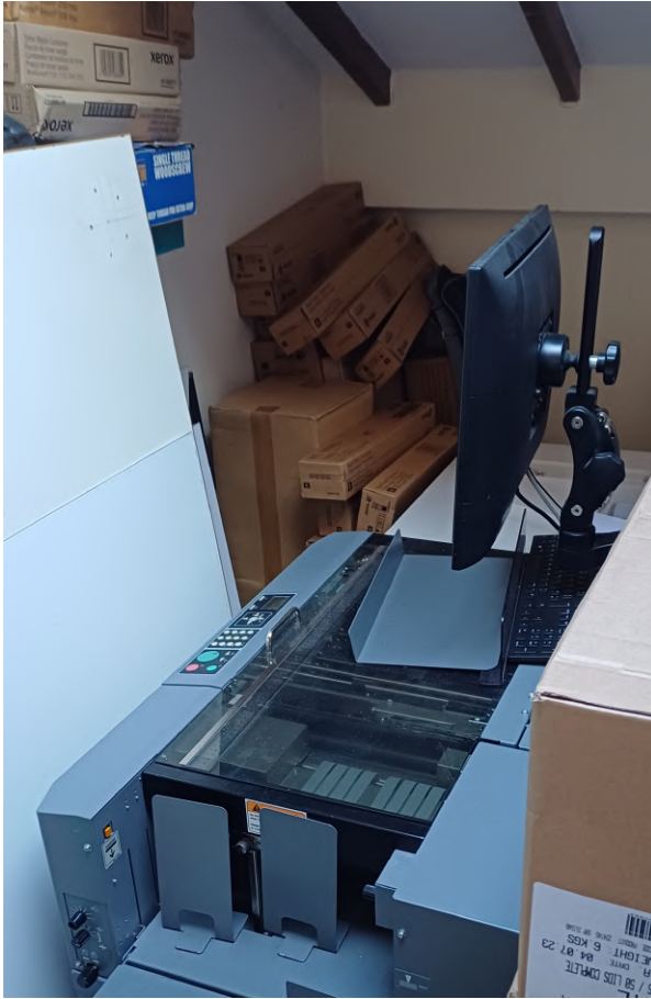
Inaccessible printers and storage