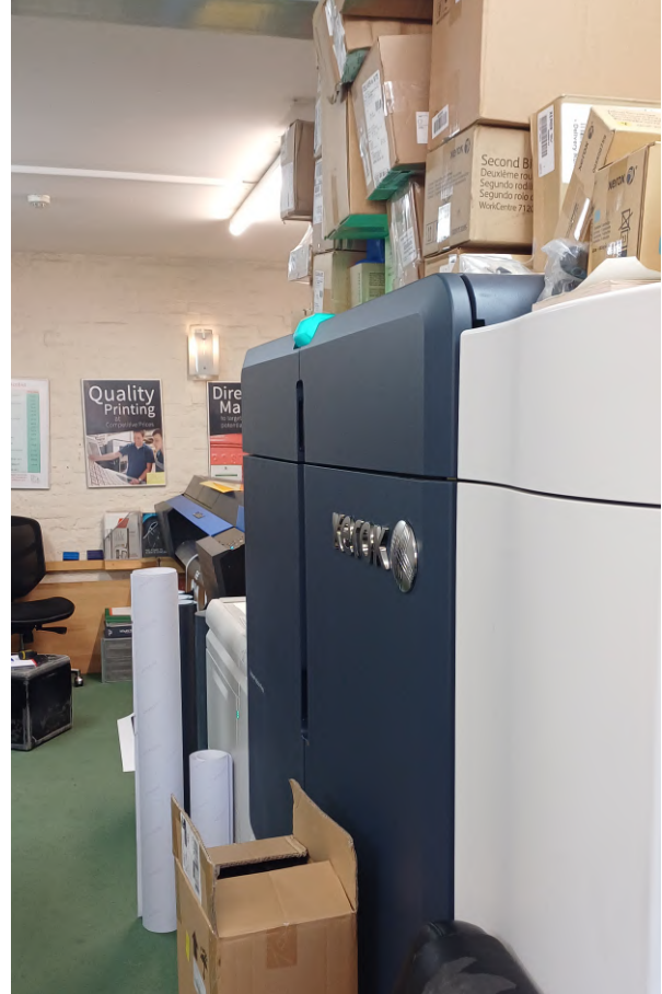
Lack of space for large Xerox machine