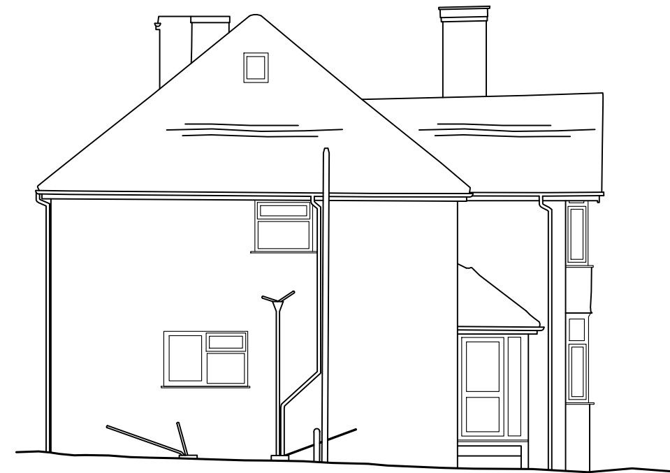
SIDE ELEVATION (NORTH FACING)