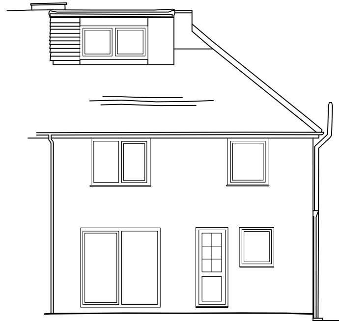
REAR ELEVATION (EAST FACING)