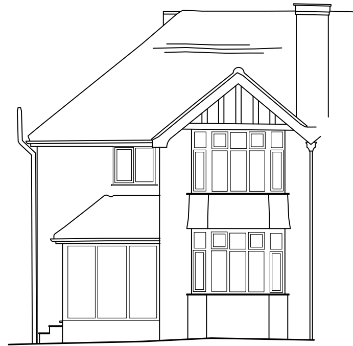
FRONT ELEVATION (WEST FACING)