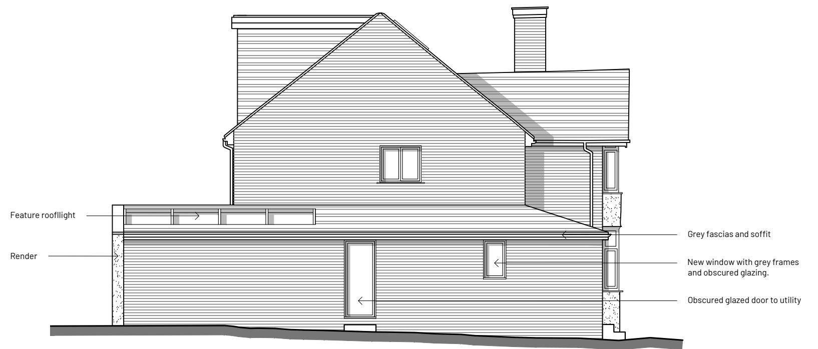
SIDE ELEVATION (NORTH FACING)