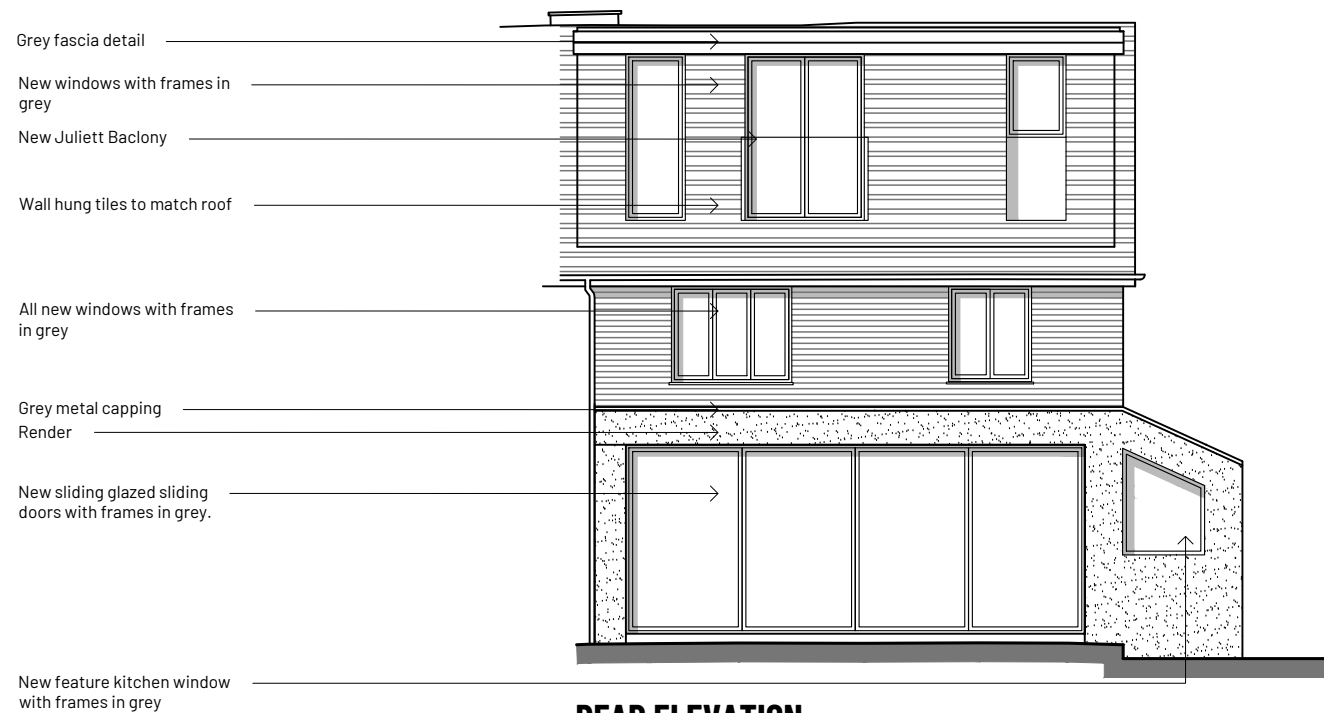
REAR ELEVATION (EAST FACING)