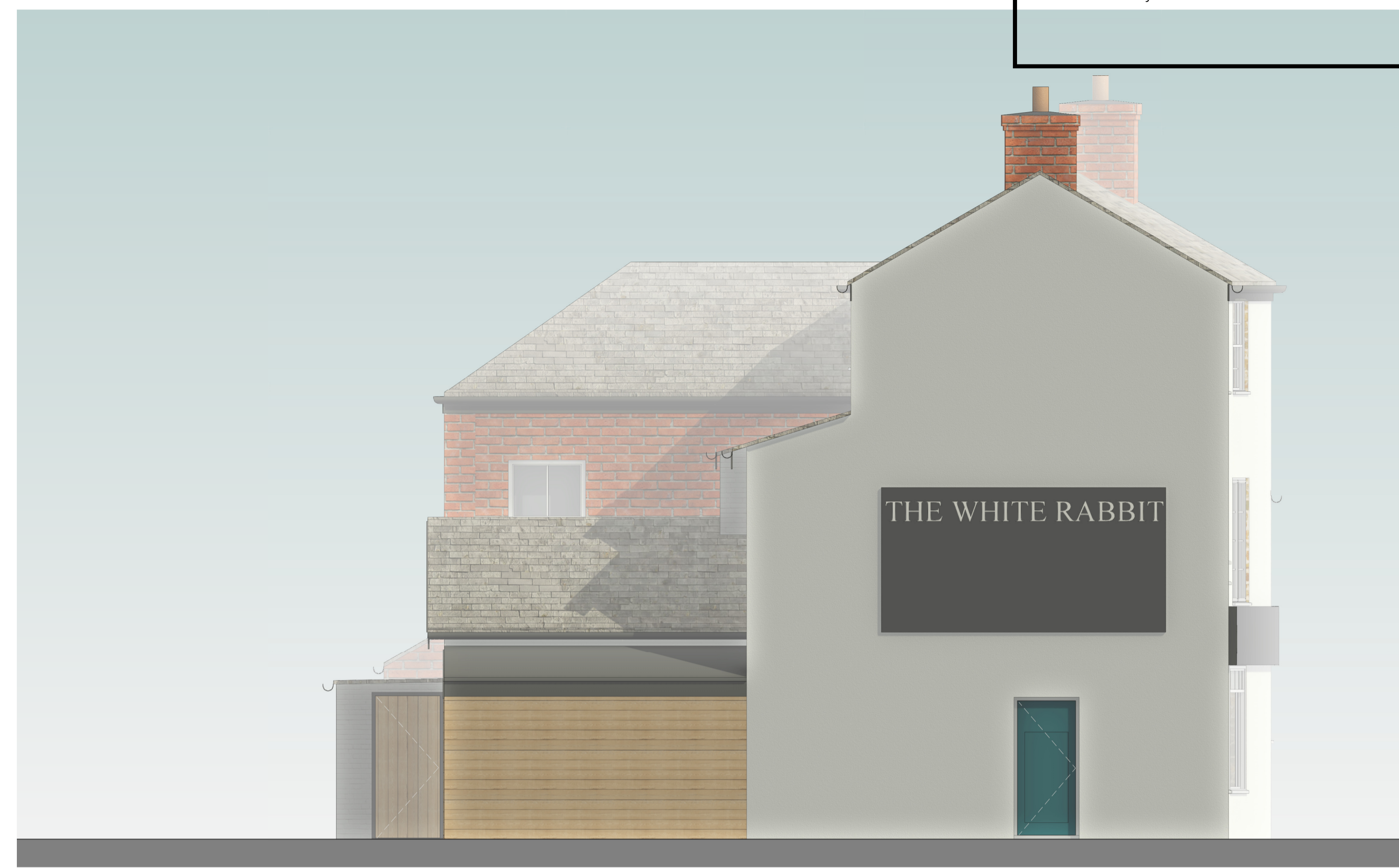
4 Side Elevation. 08 70 01 1:50