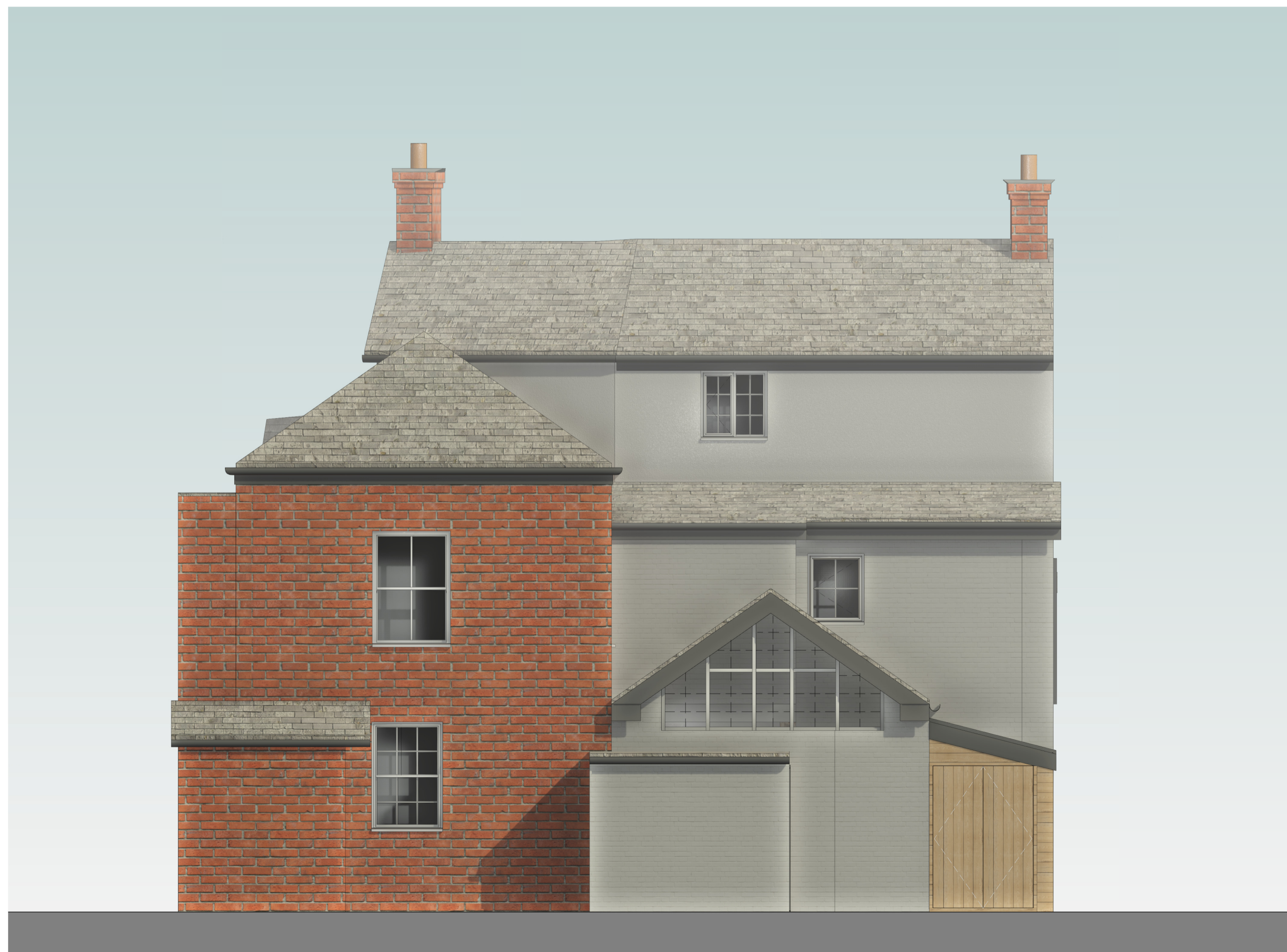
1 Side Elevation 2. 08 70 01 1:50