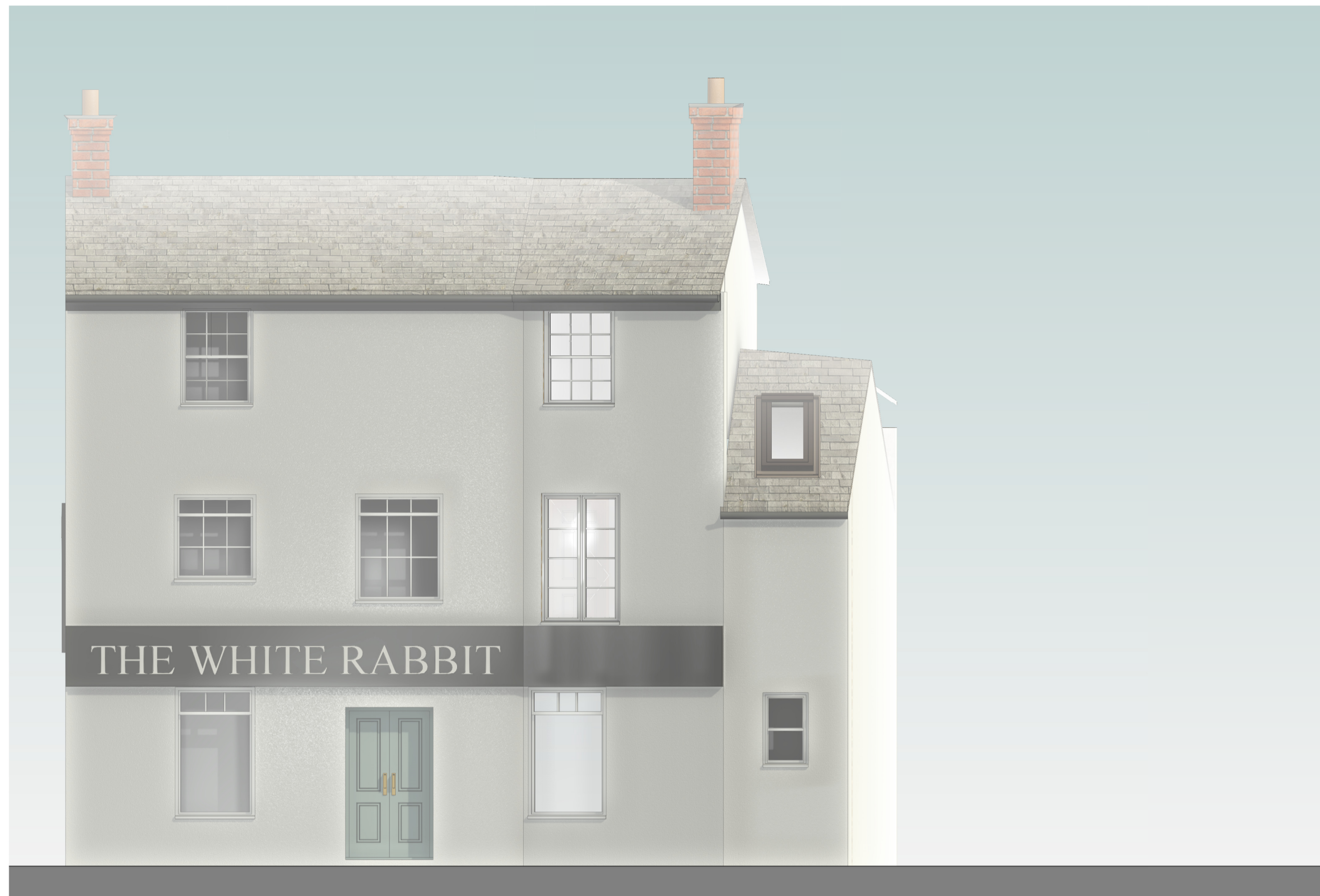
3 Front Elevation. 08 70 01 1:50