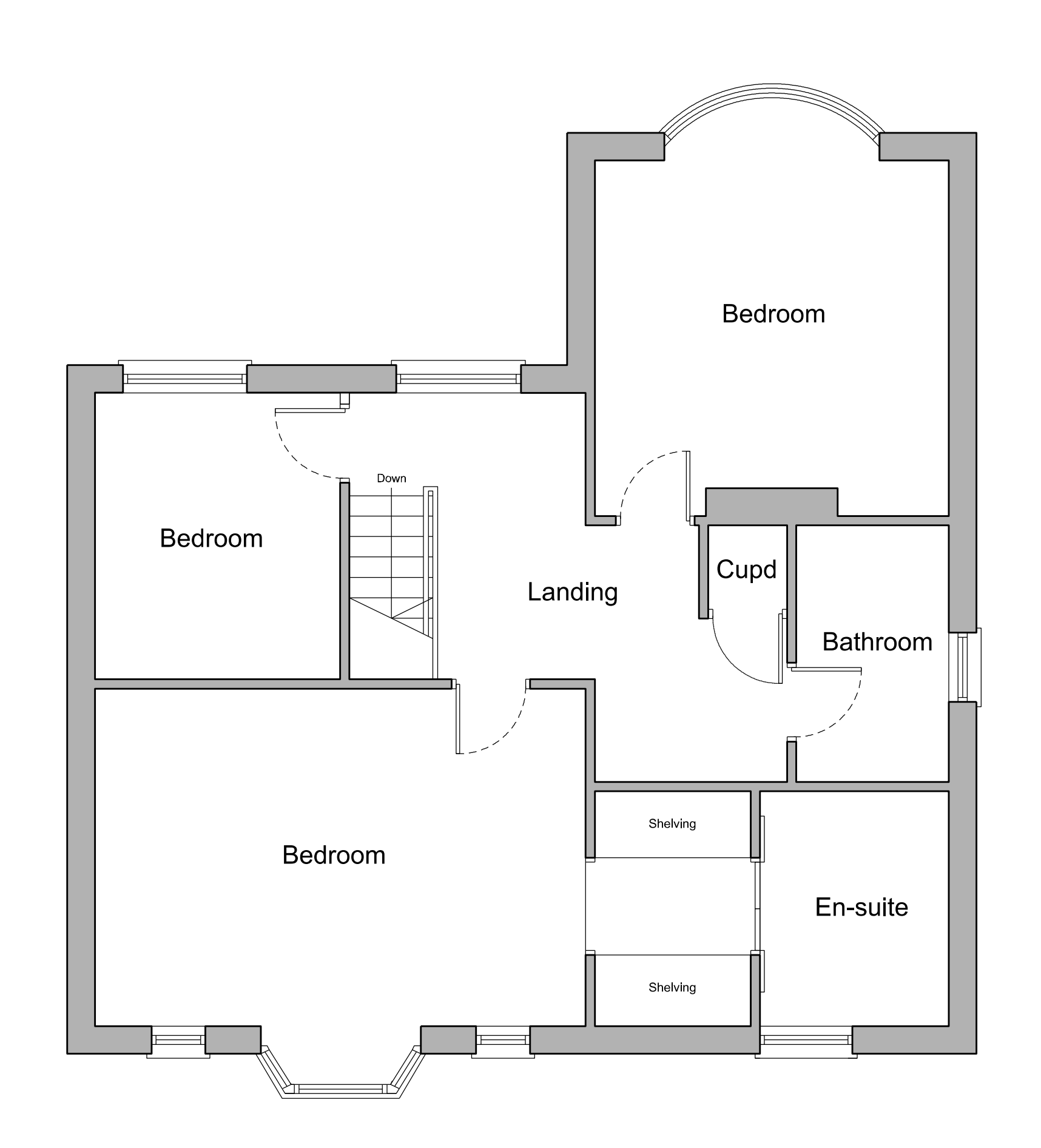
Existing First Floor Plan