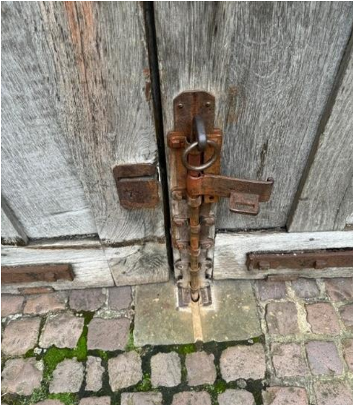
Photograph No 4

Existing 'Shoot bolt' retained and extended. Later addition hasp arrangement to be removed.