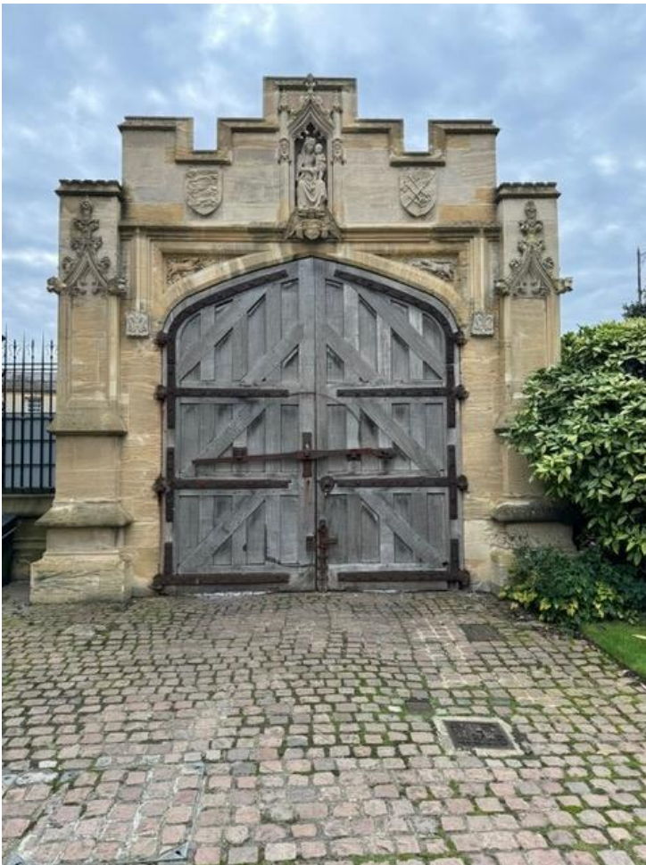
Photograph No 2

South facing elevation of the Bodley and Garner gate viewed from the high street.