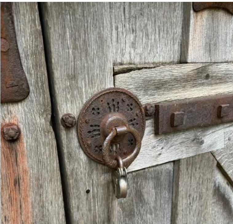
Photograph No 7

Existing bracket retained and relocated. 'Chock' to be installed within bracket with aperture to receive new slide bolt.