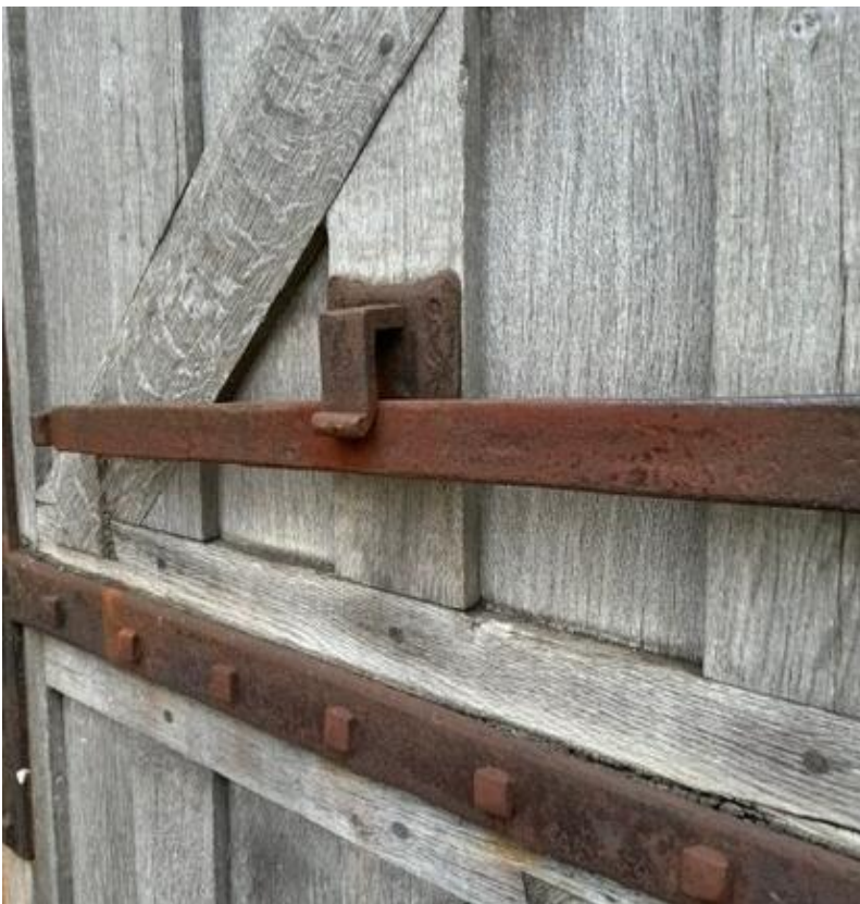
Photograph No 9

Existing Pivoting Brace retained. Brace to be turned 90 degrees and fixed in place. Boss to be installed behind back place with notch to receive proposed slide arm.