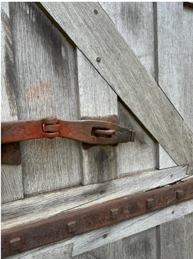
Photograph No 5

Existing 'Shoot bolt' retained and extended. Later addition hasp arrangement to be removed.