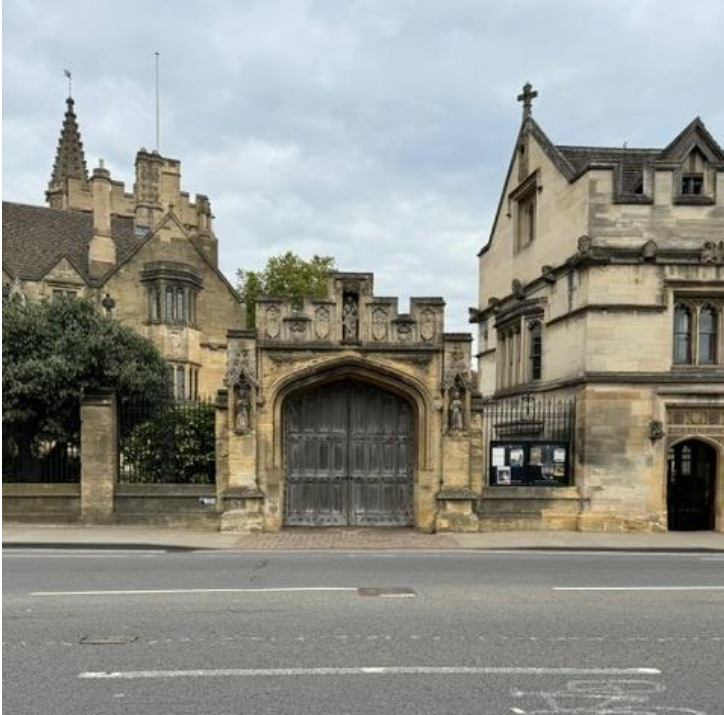
Photograph No 1

South facing elevation of the Bodley and Garner gate viewed from the high street.