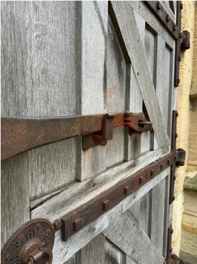
Photograph No 6

Existing bracket retained and relocated. 'Chock' to be installed within bracket with aperture to receive new slide bolt.