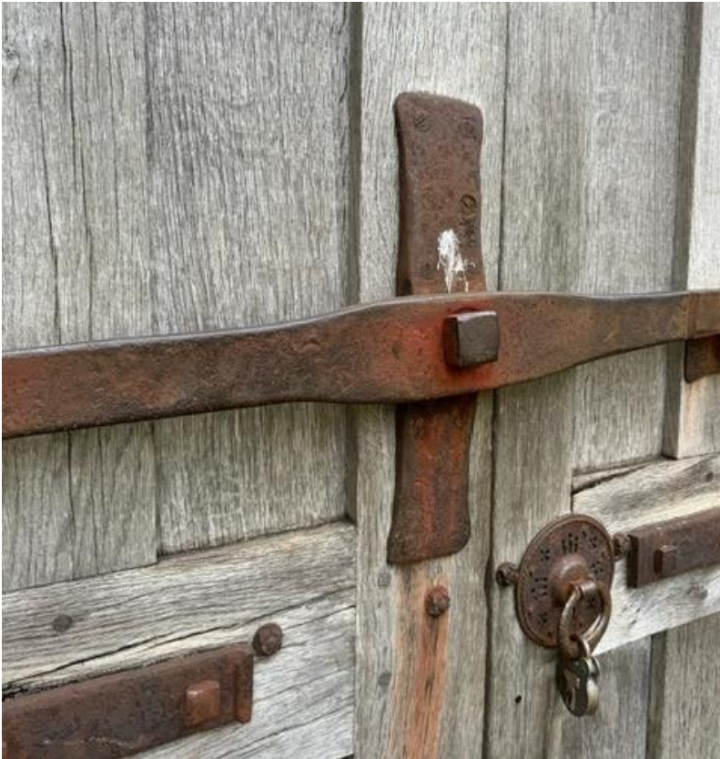
Photograph No 8

Existing Pivoting Brace retained. Brace to be turned 90 degrees and fixed in place. Boss to be installed behind back place with notch to receive proposed slide arm.