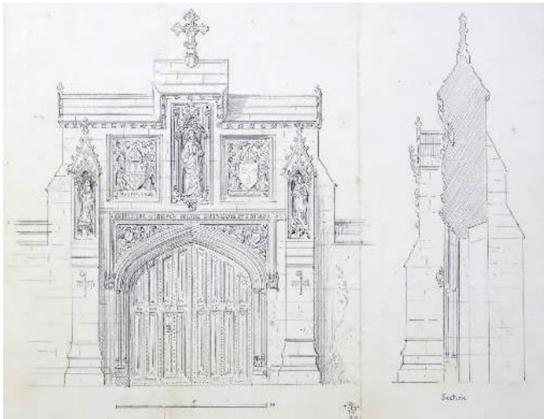
AWN Pugin, street elevation and section of proposed High Street gate, MC:FAI7/3/IAD/I fol. 5