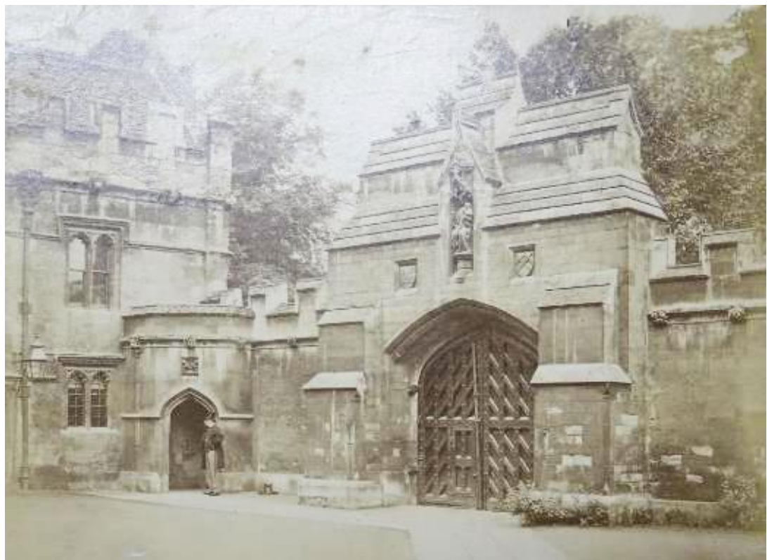
St John's Quad elevation of the Pugin gate, with adjoining porters' 'small room' (and porter) MC:FAI/9/4P/2