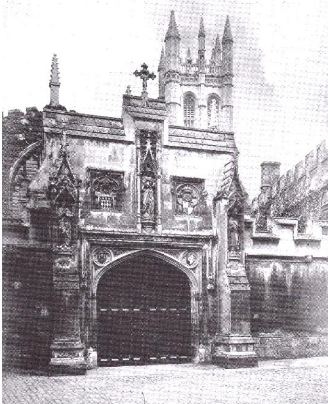
Street elevation of Pugin's gate shortly before its demolition in 1883 [Roger White, The Architectural Drawings of Magdalen College Oxford: a Catalogue , 2001]