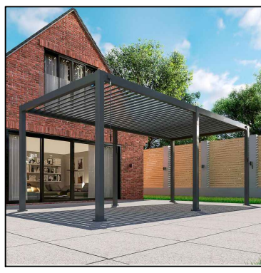
METAL FRAMED LOUVERED ROOF CANOPY