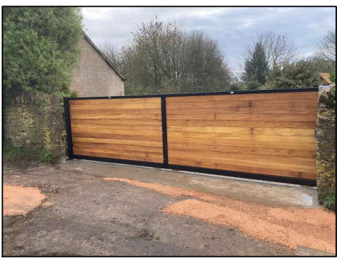
METAL FRAMED TIMBER SLIDING GATE