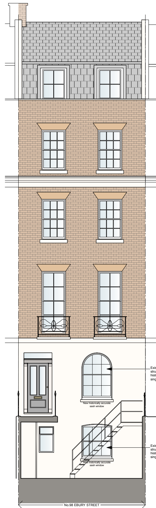
FRONT/SOUTH ELEVATION AS PROPOSED