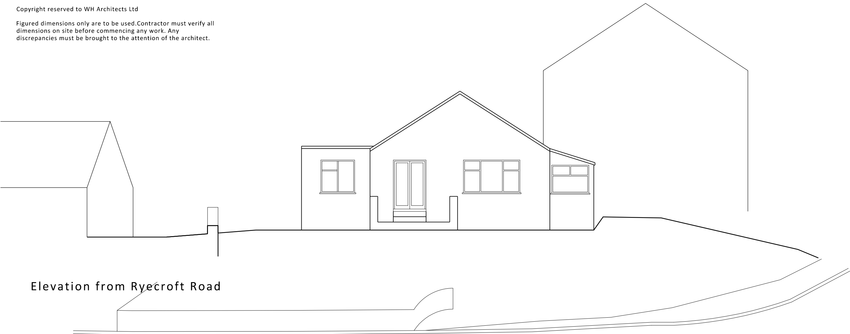
Elevation from Ryecroft Road