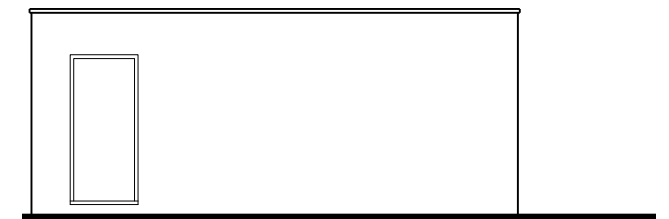
West Elevation Garage