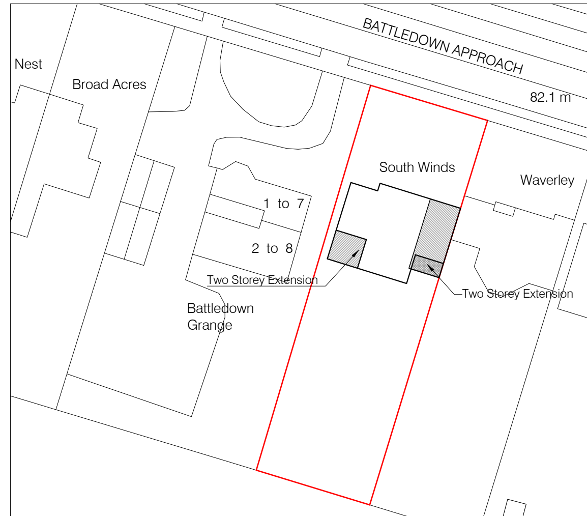
Proposed - SITE PLAN (BLOCK PLAN) 1:500