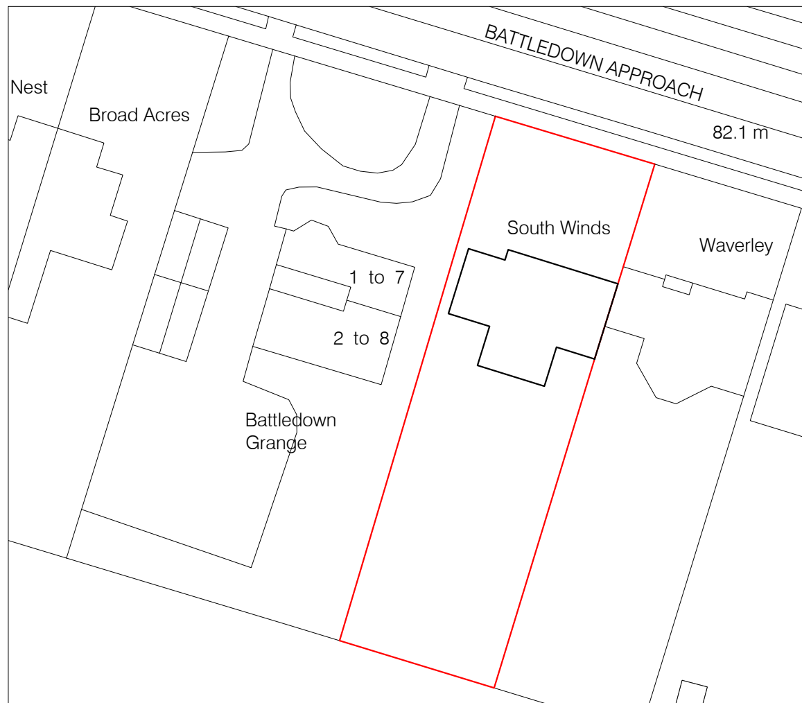
Existing - SITE PLAN (BLOCK PLAN) 1:500