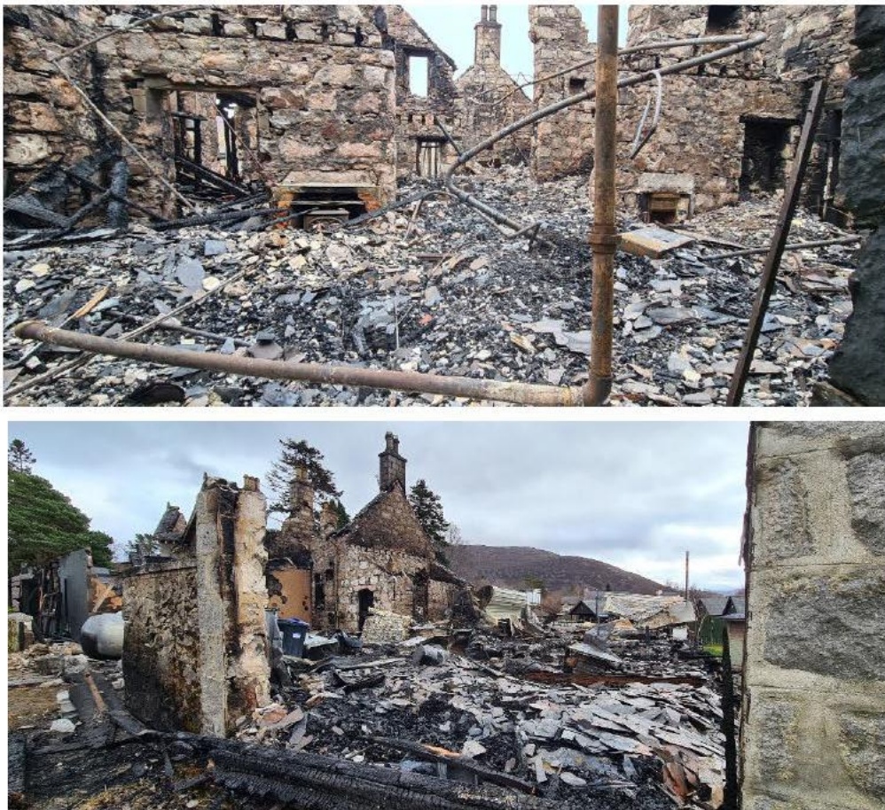
Fig 3. Extent of internal fire damage.

The damage sustained to Braemar Lodge Hotel was catastrophic. In respects to the damage to the building by fire, this was extensive and substantial throughout. All building structural elements such as first floor joists, roof joists, internal linings and stair were destroyed by the fire as seen in figure 3 below.