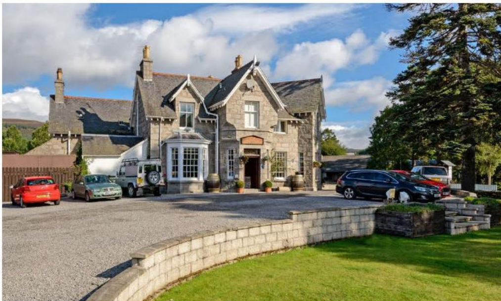
Fig 2. Building prior to the extensive fire

19 th Century and has had additions built onto its North and West elevations over time.