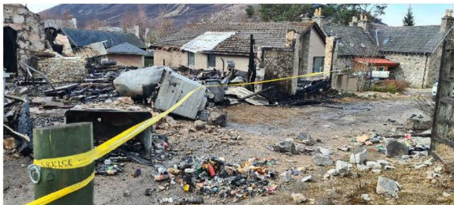
Fig 4. Debris damage to neighbouring property following LPG explosion.