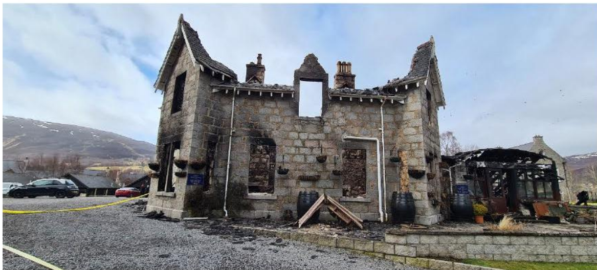
Fig 5. Building after fire damage.