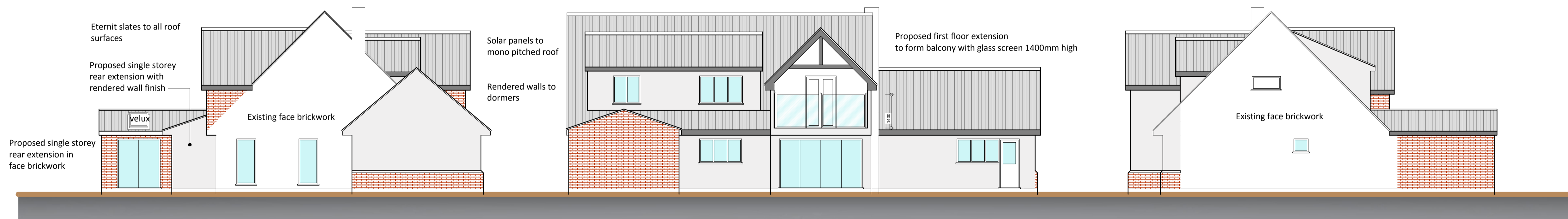
SIDE ELEVATION (E)