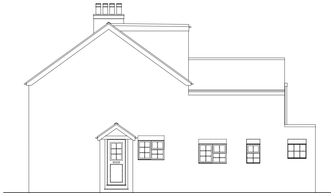
Side Elevation - Scale 1:100