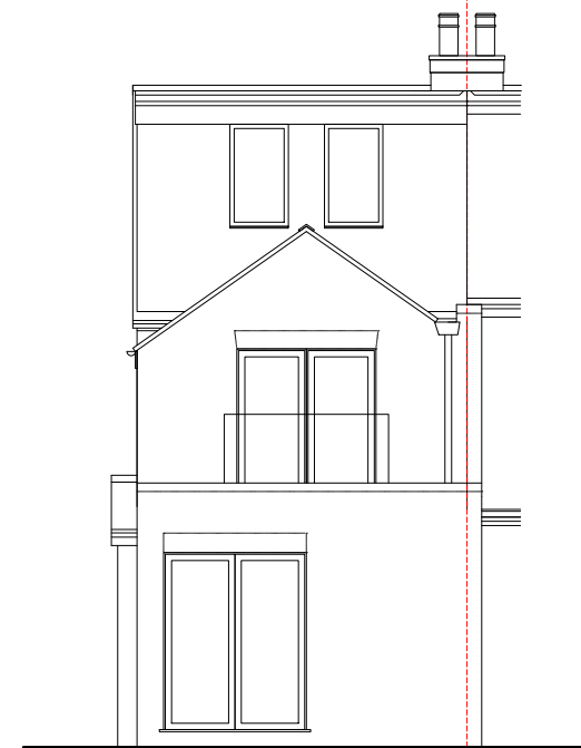
Rear Elevation - Scale 1:100