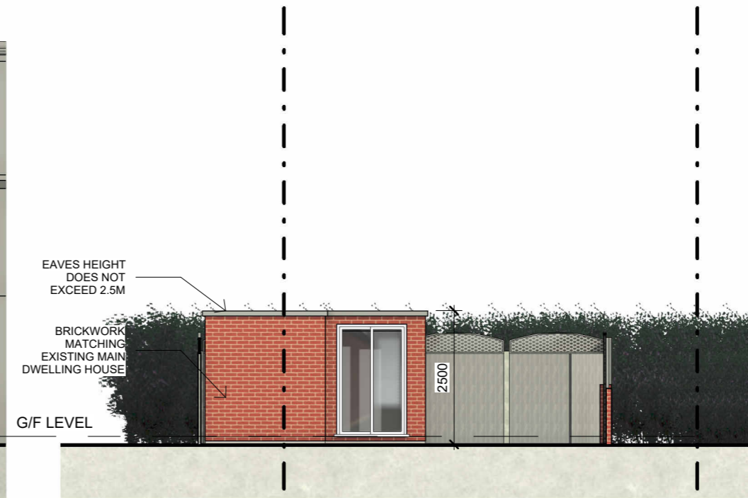
3 PROPOSED NORTH WEST ELEVATION (OUTBUILDING)