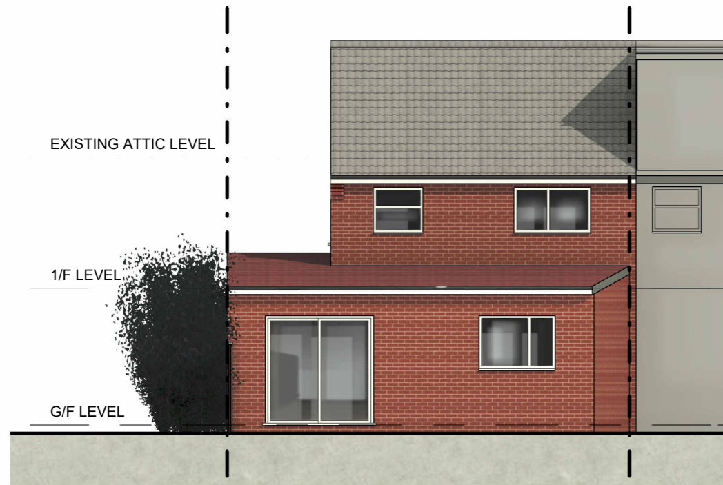
1 PROPOSED NORTH WEST ELEVATION (UNCHANGED)