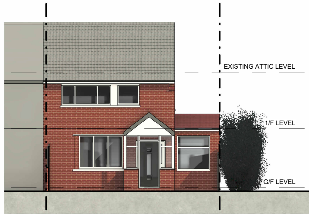
1 PROPOSED SOUTH EAST ELEVATION (UNCHANGED)