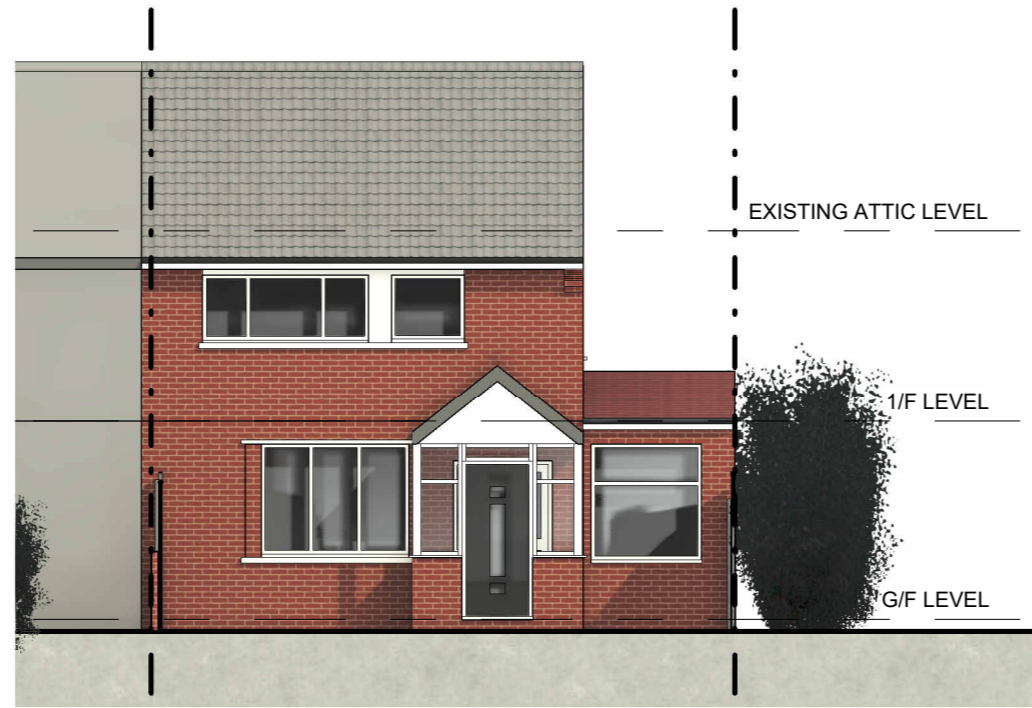
1 EXISTING SOUTH EAST ELEVATION