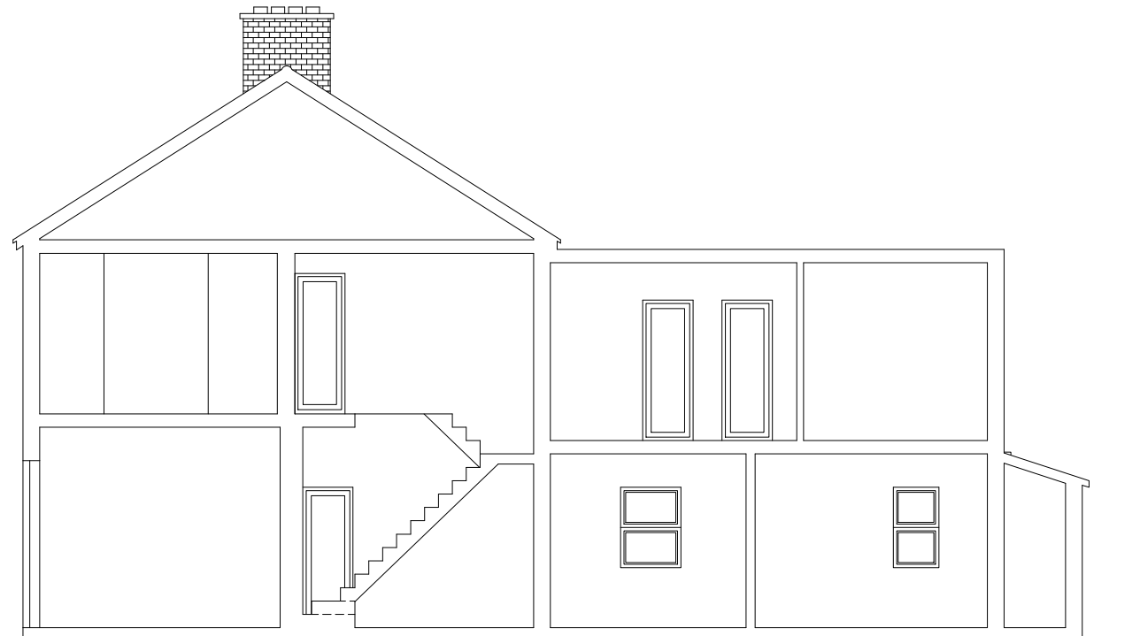
EXISTING SECTION A-A (1:100 @ A3)

+8550 RL +5950 LFL +3350 FFL +150 GFL ±0 GL