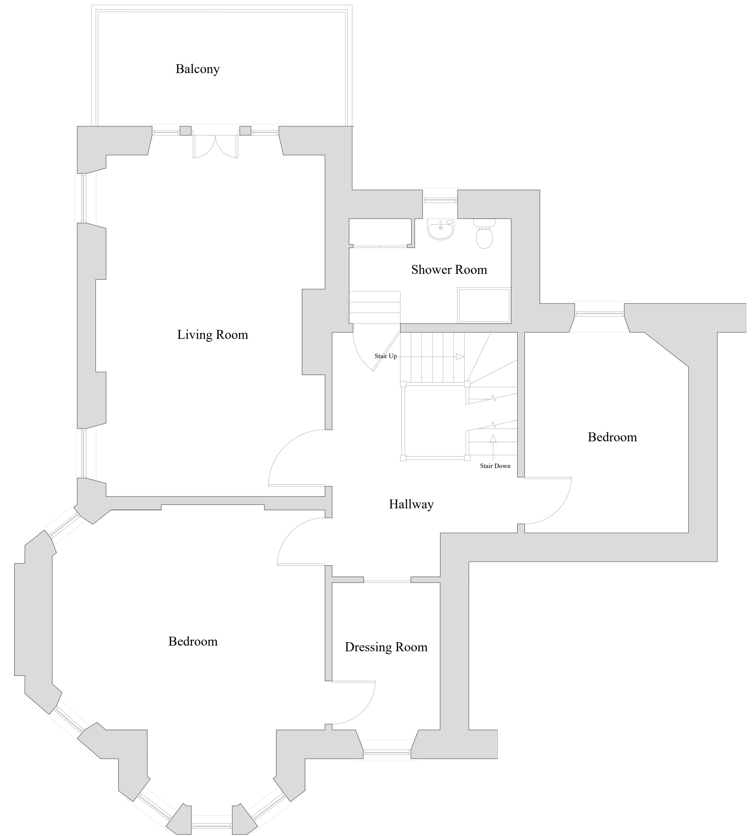
1:50 FIRST FLOOR PLAN AS EXISTING