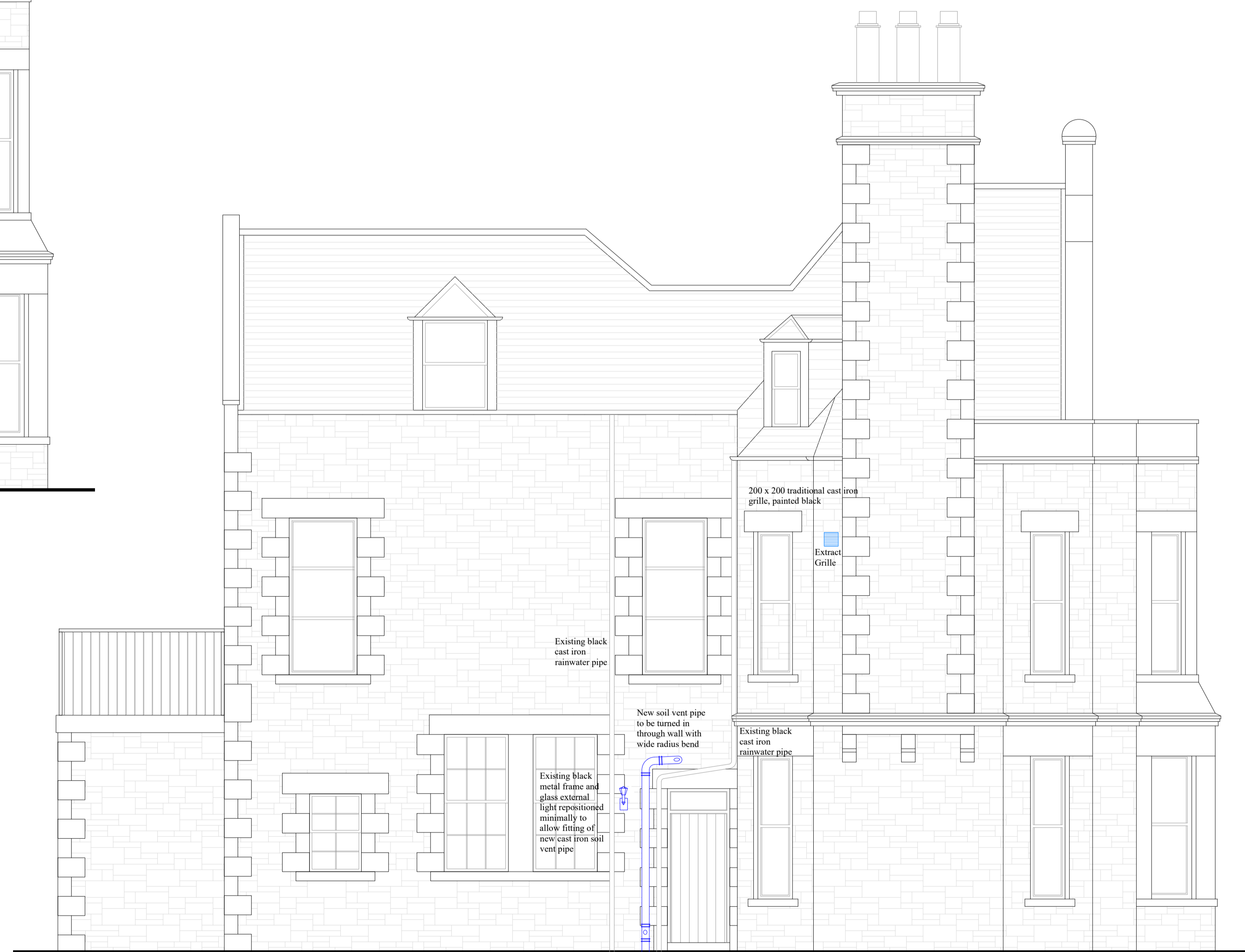
1:50 PROPOSED SOUTH ELEVATION

New Svp to be installed alongside the existing cast iron rainwater pipe. Existing external wall light to be repositioned minimally to allow fitting of new cast iron Svp. New 100mm diam traditional cast iron soil vent pipe installed to side of building. Base of the Svp connected into the underground drainage at side of building. Svp to extend up to above door lintel level and turned in through the wall, all formed using traditional cast iron pipework and brackets. Full extent of the Svp to be painted black.