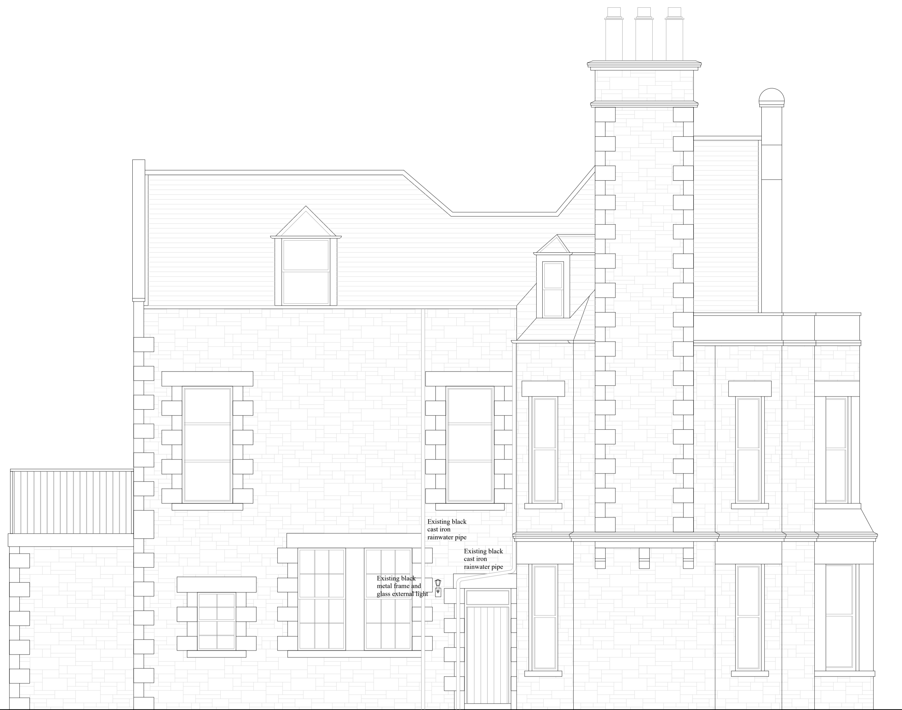
1:50 EXISTING SOUTH ELEVATION

No dimensions to be scaled from drawing. All dimensions to be checked on site. Any discrepancy to be notified immediately.